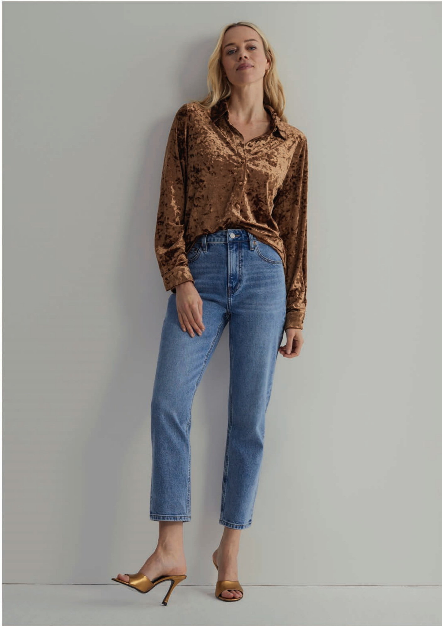
BOBIE CRUSHED VELVET | TARA L.STONE USED