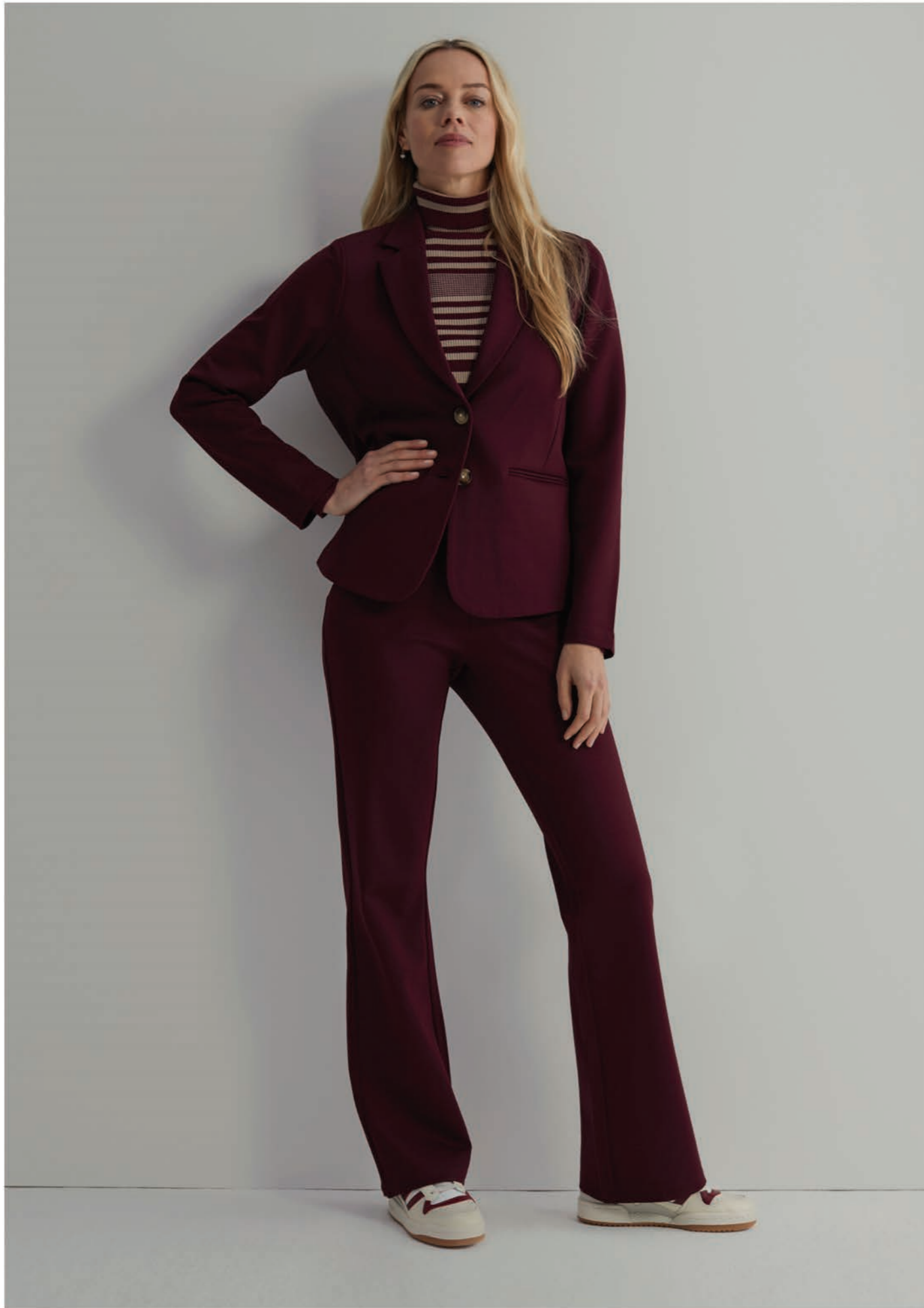
BLAZER PUNTA | ROLL NECK FANCY STRIPE | BIBETTE PUNTA