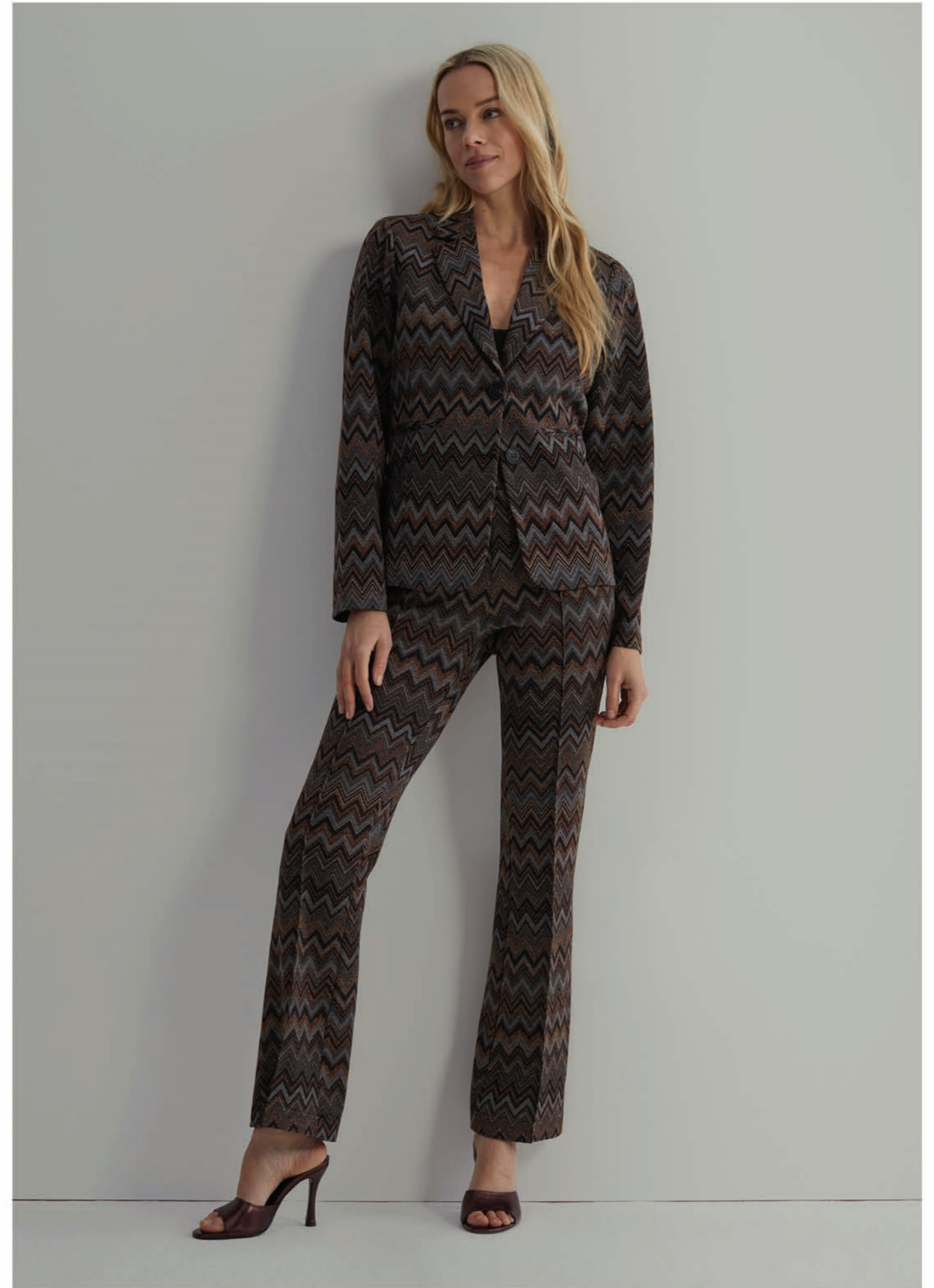
BLAZER ZIGZAG | BIBETTE ZIGZAG