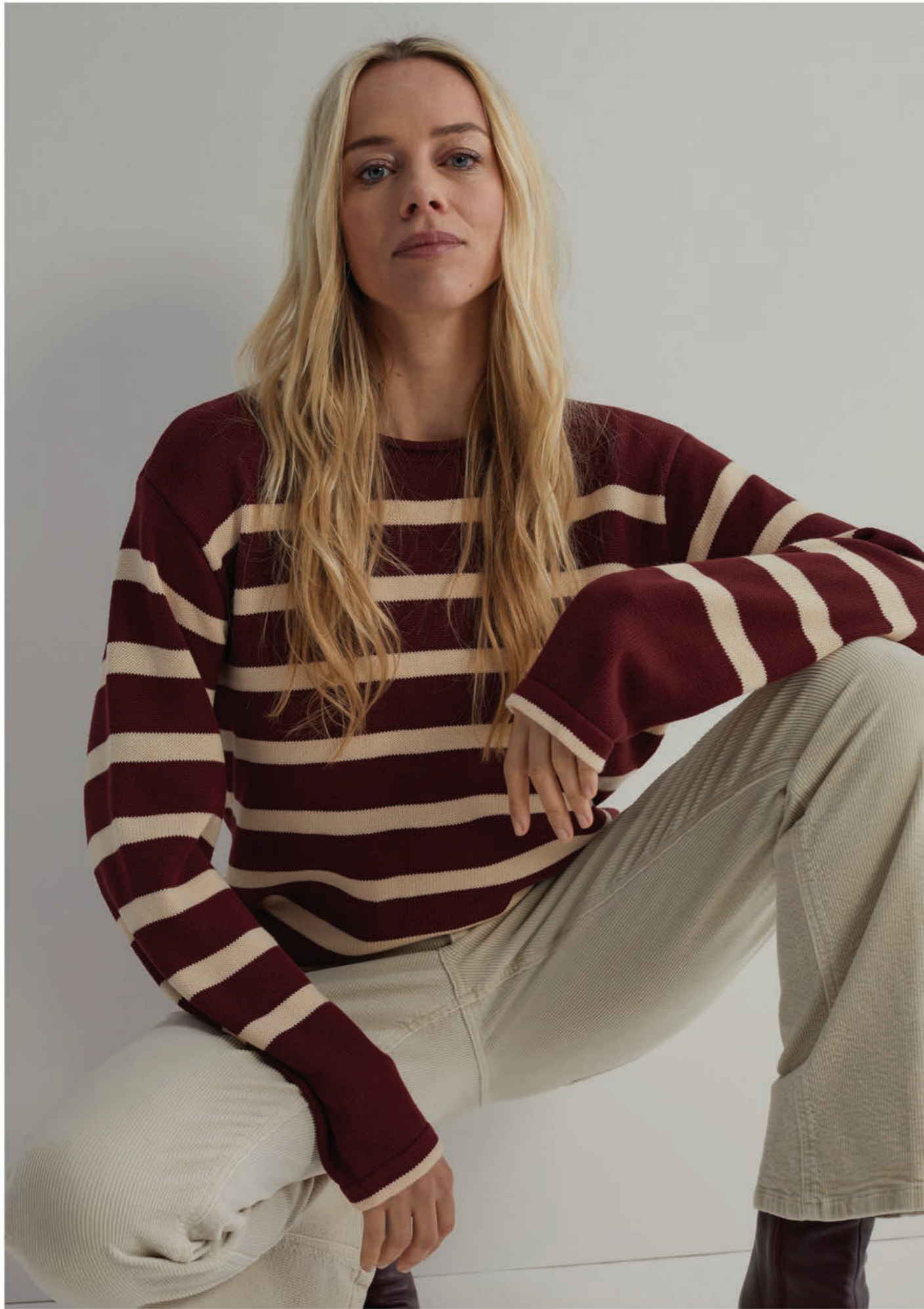
SWEET CLASSIC STRIPE | BIBETTE CORD