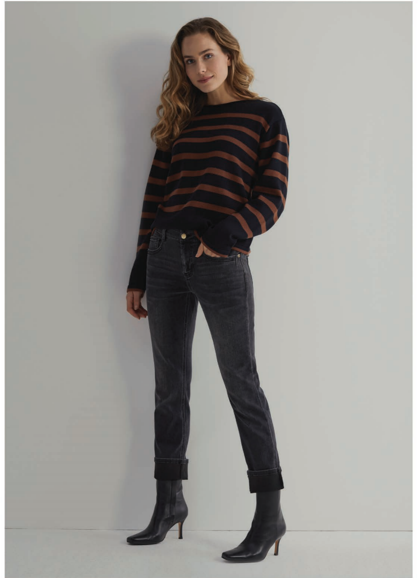
SWEET CLASSIC STRIPE | KATE TURNUP BLACK DENIM