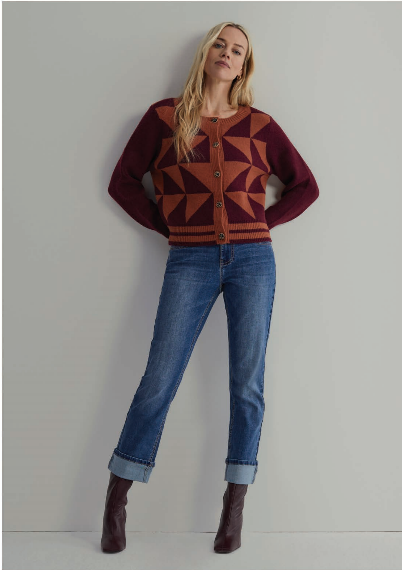
CHANEL TRIANGLE | KATE TURN UP BLUE DENIM