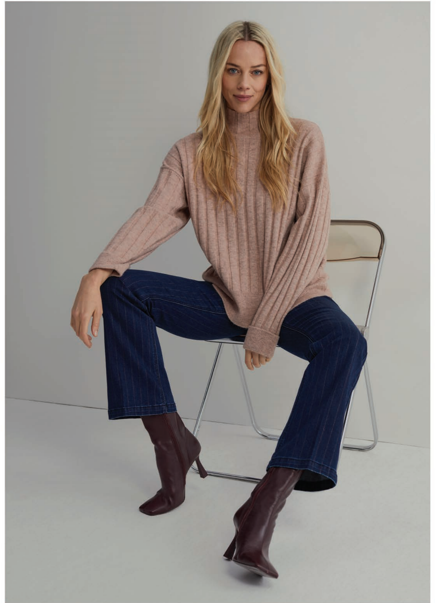
SWEET RIB AND TURTLE | BIBETTE COPPER PINSTRIPE