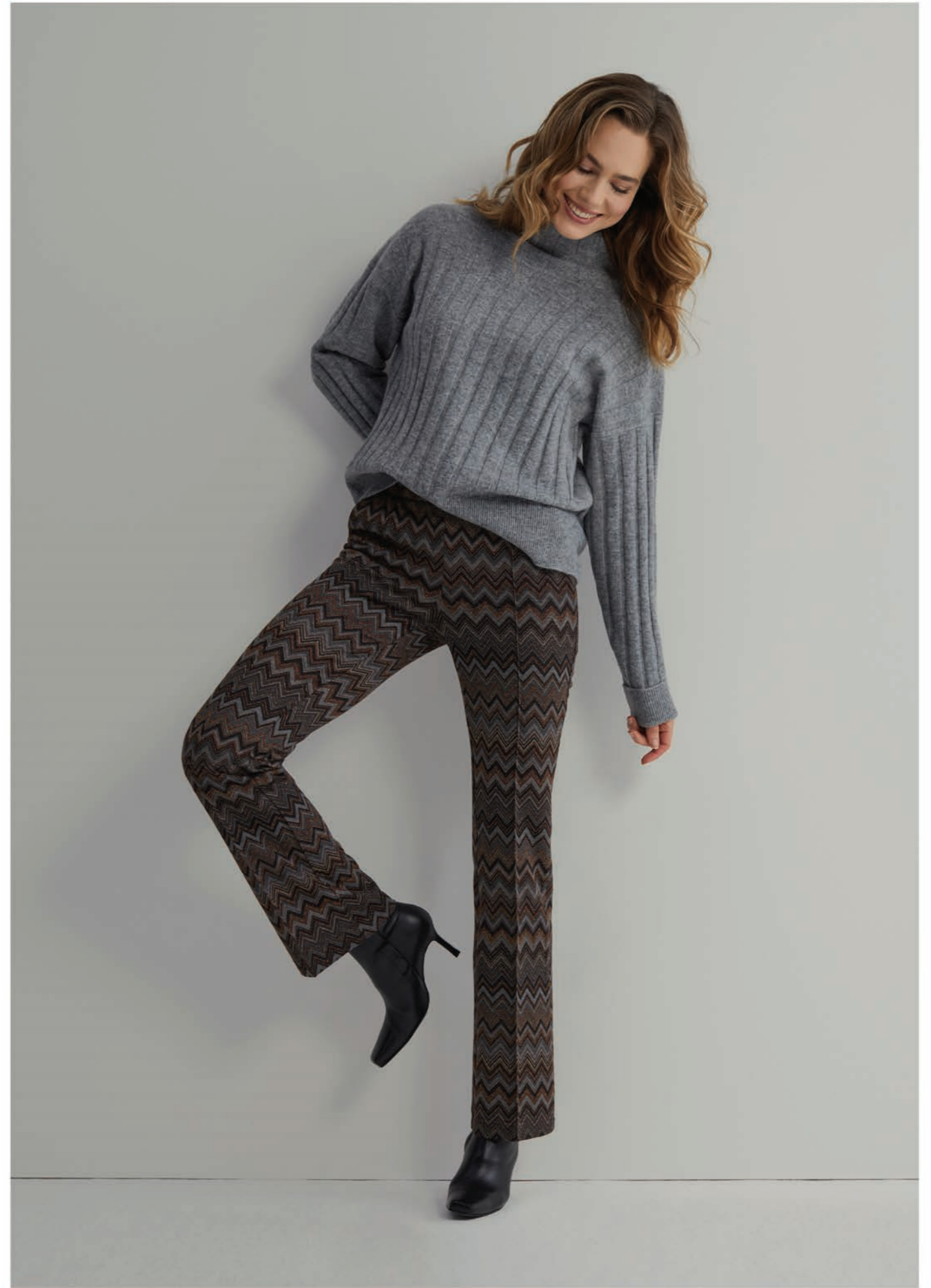
SWEET RIB AND TURTLE | BIBETTE ZIGZAG