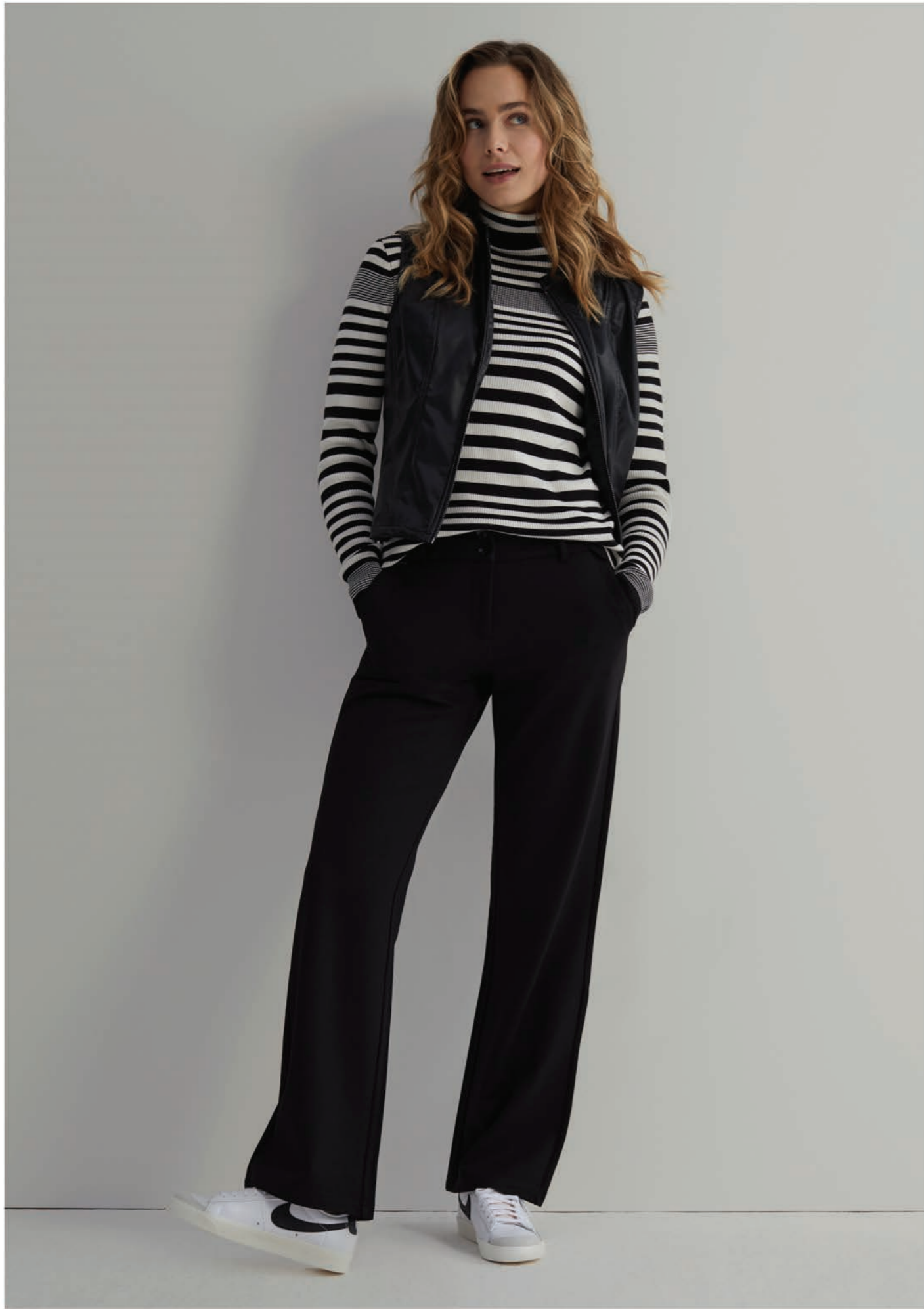
SHEENA SLEEVELESS FAUX LEATHER | ROLL NECK FANCY STRIPE | COCO PUNTA