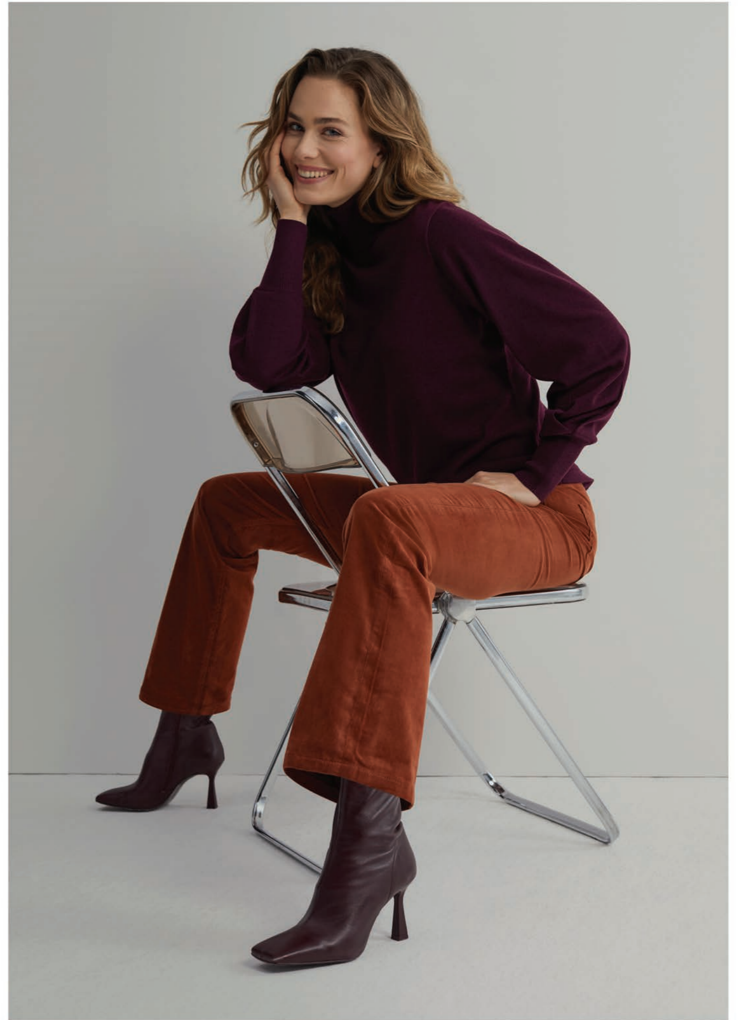
SWEET ROLL NECK PUFF SLEEVE | BABETTE FINE CORD