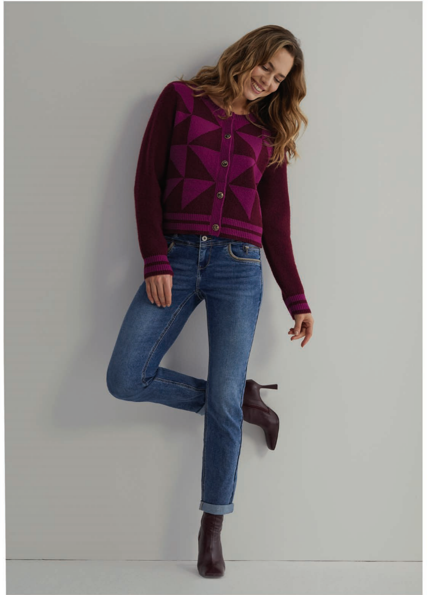
CHANEL TRIANGLE | SIENNA 1 ZIP & EMBROIDERY