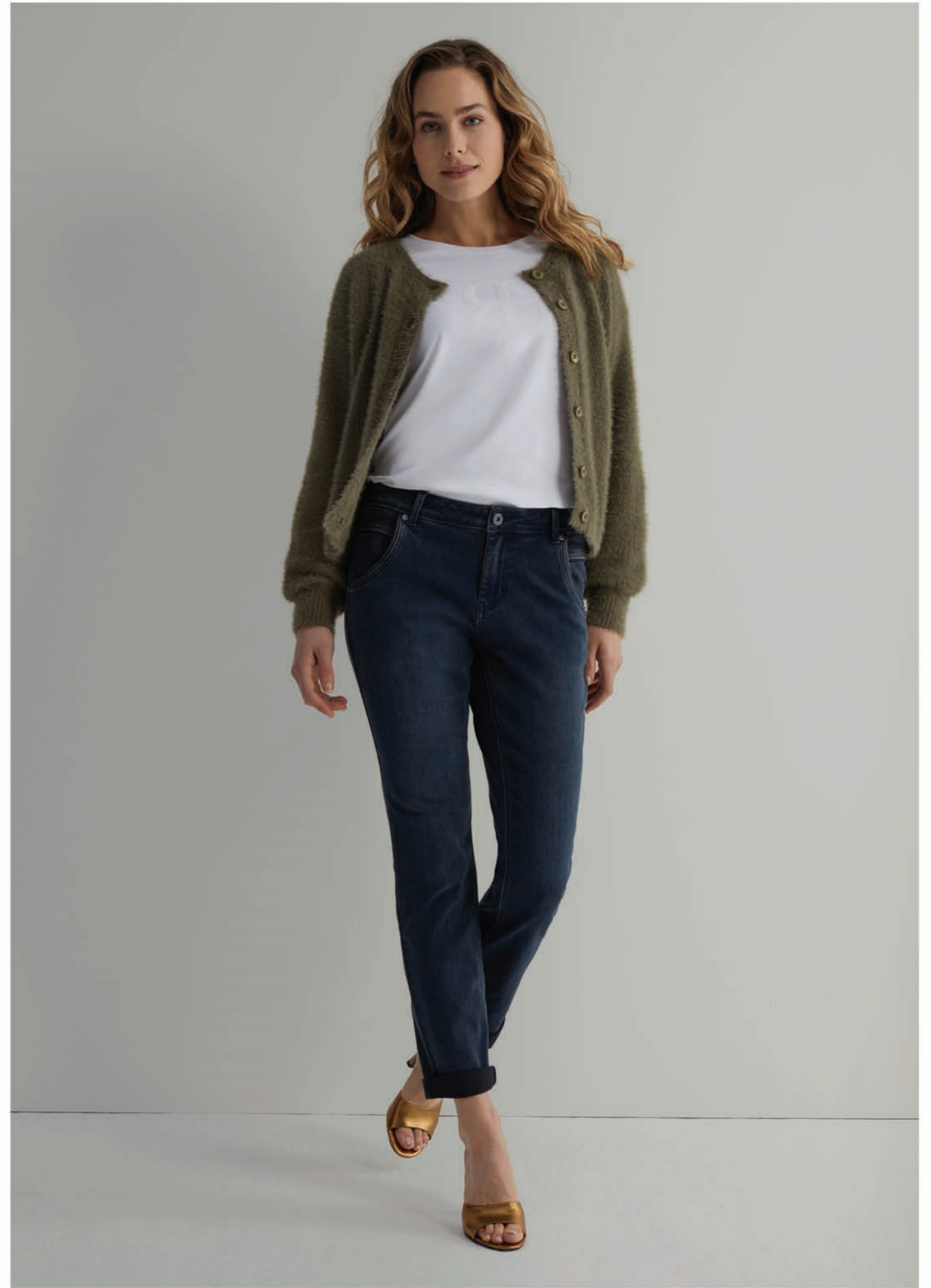
CARDIGAN FLUFFY | TEMMY RB FLOCK | FLORA