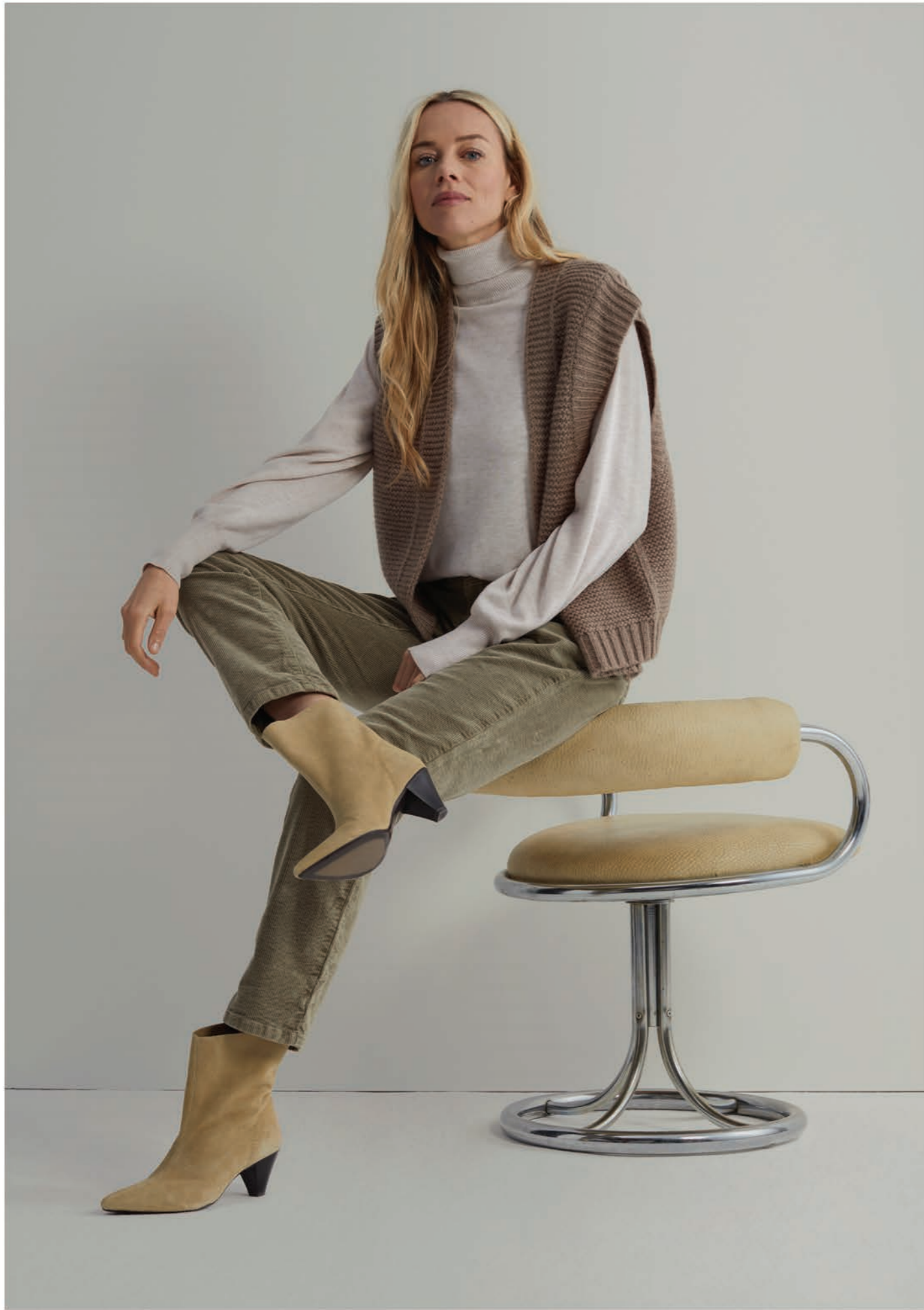
CARDIGAN SLEEVELESS | SWEET ROLL NECK PUFF SLEEVE | SIENNA CORD