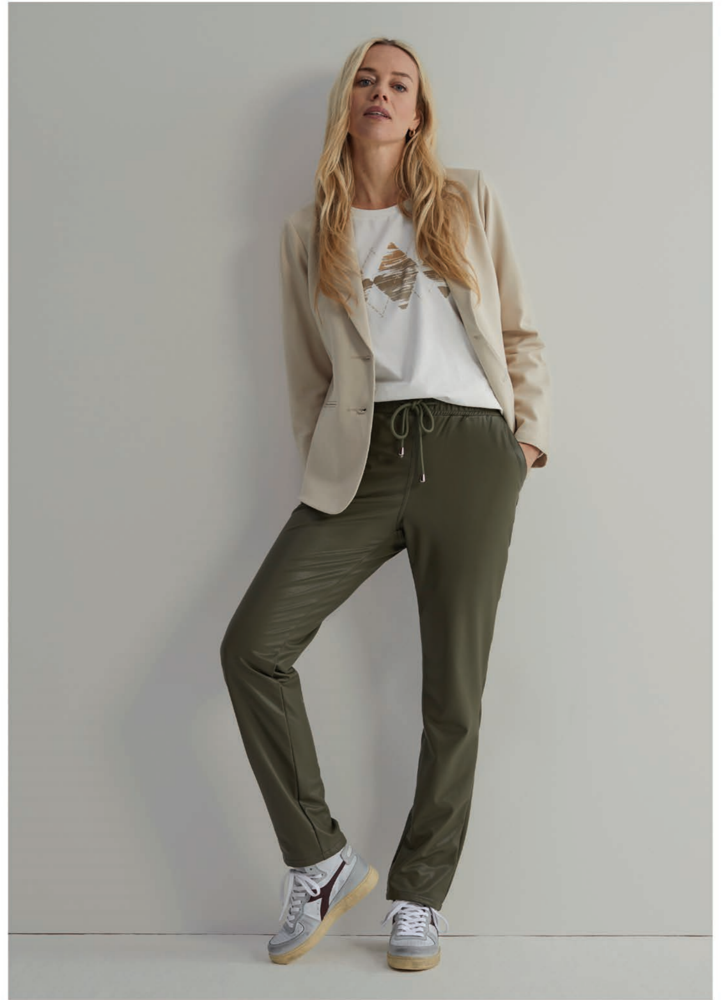
BLAZER PUNTA | TEMMY ARGYLE | TESSY FAUX LEATHER