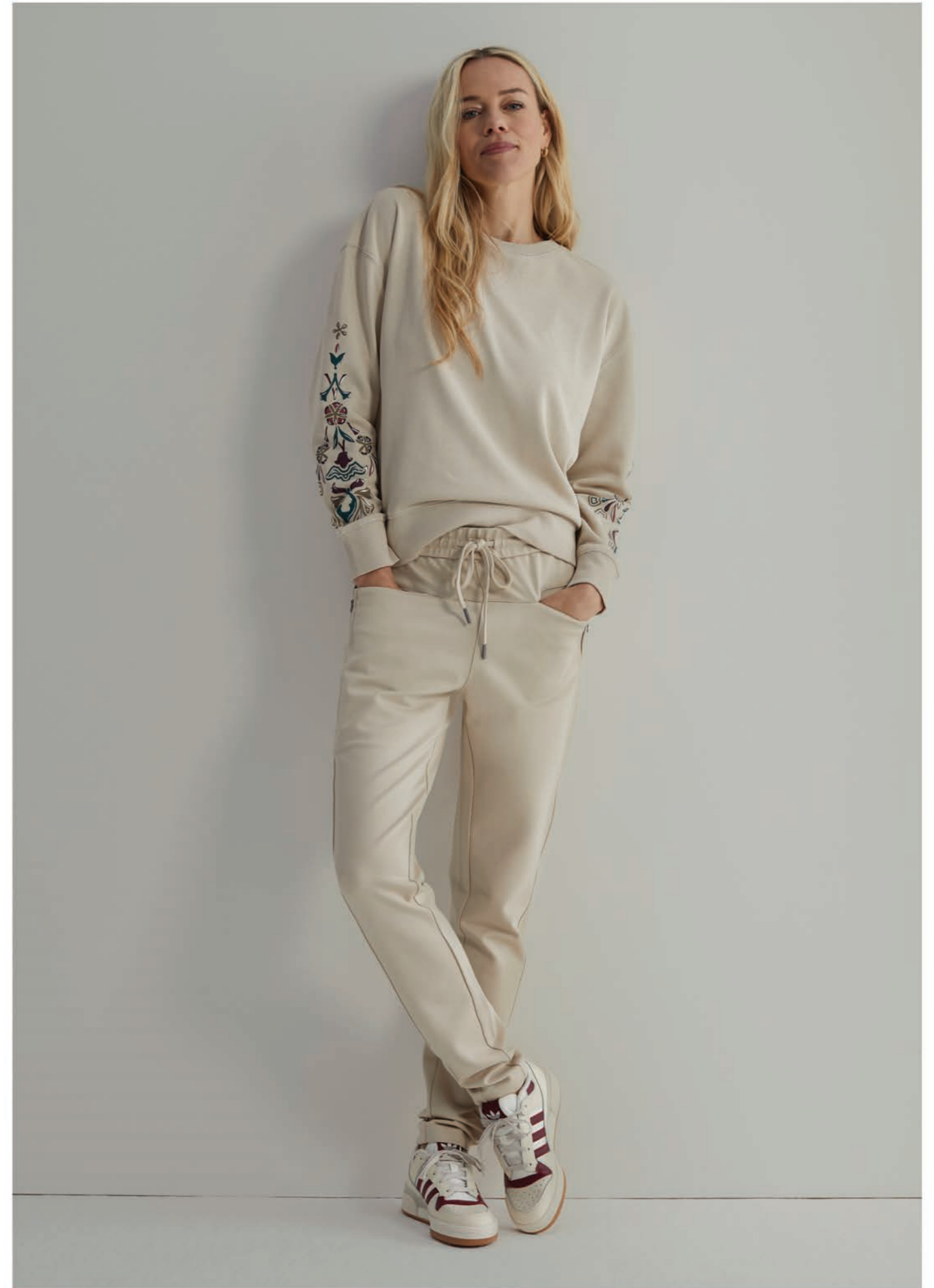
TERRY SWEATER MULTIPRINT | TESSY PUNTA