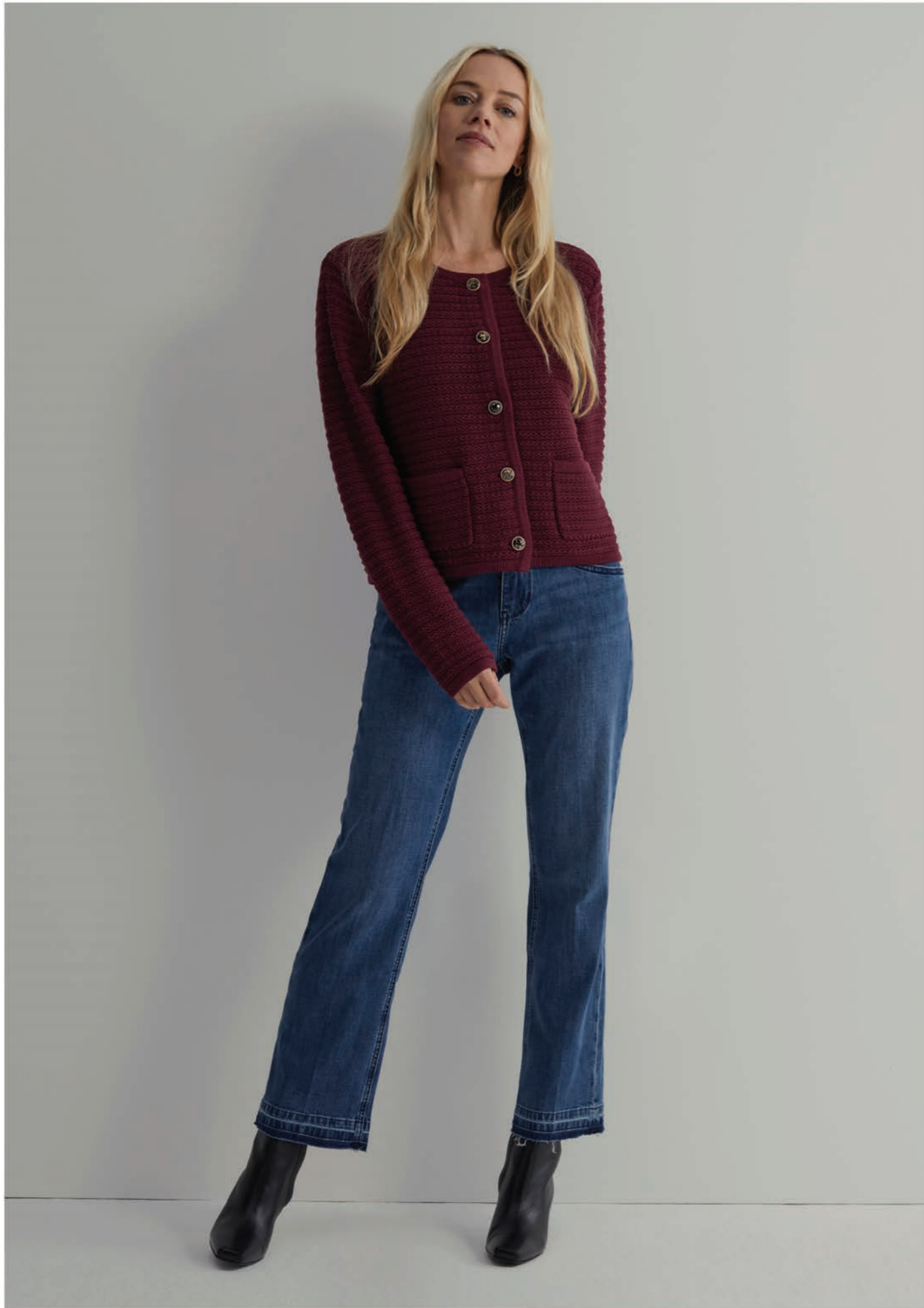
CHANEL JKT | BABETTE CRP MIDSTONE