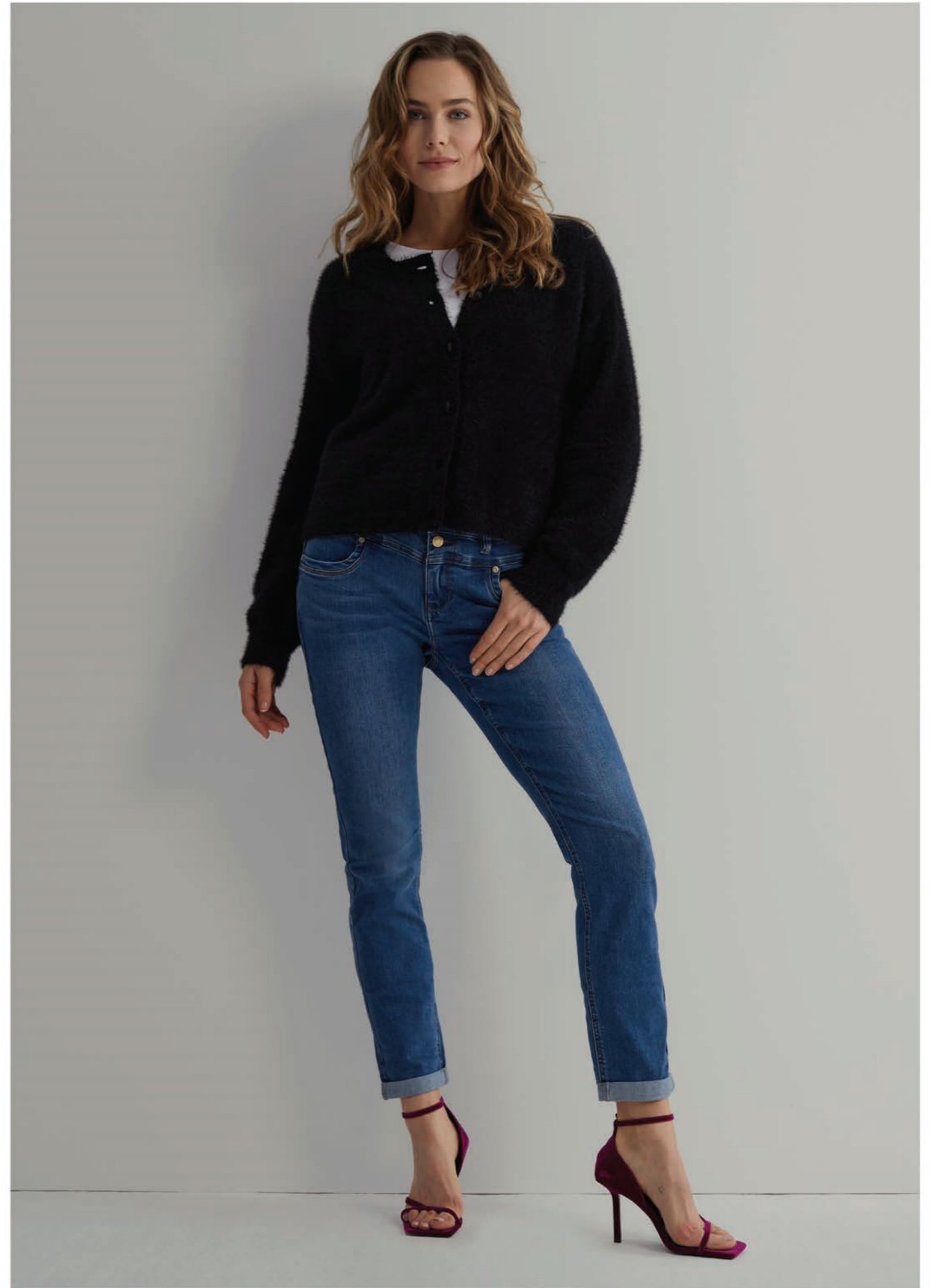
CARDIGAN FLUFFY | TEMMY RB FLOCK | SIENNA STONE USED