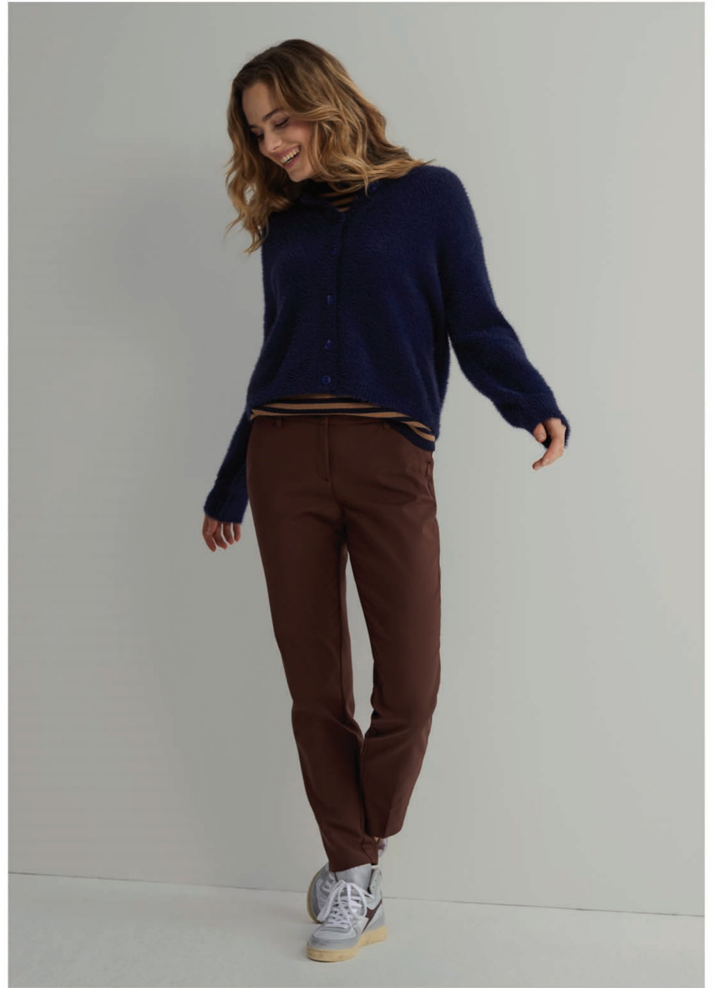
CARDIGAN FLUFFY | ROLL NECK FANCY STRIPE | DIANA SMART