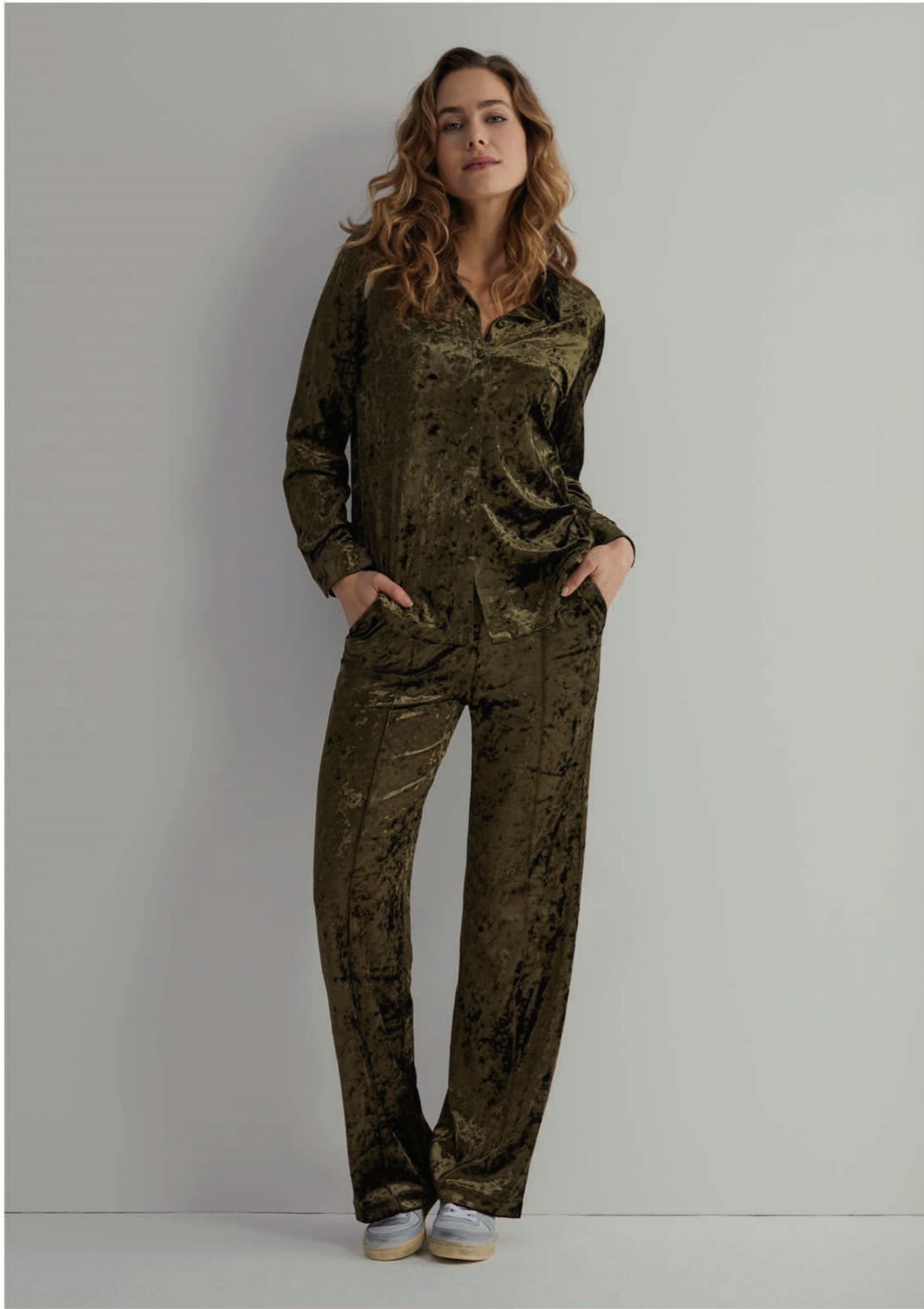
BOBIE CRUSHED VELVET | COCO CRUSHED VELVET