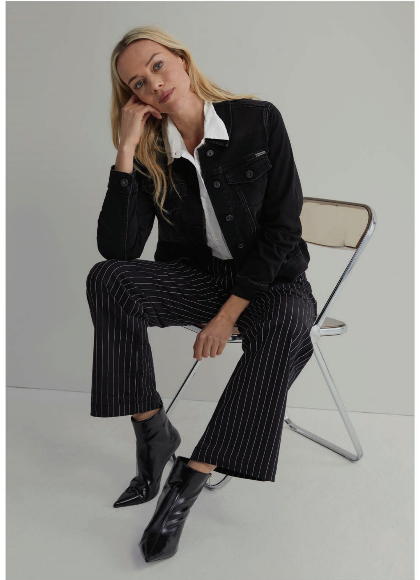
JACKY BLACK DENIM | BOBIE EMBROIDERY | COCO PINSTRIPE