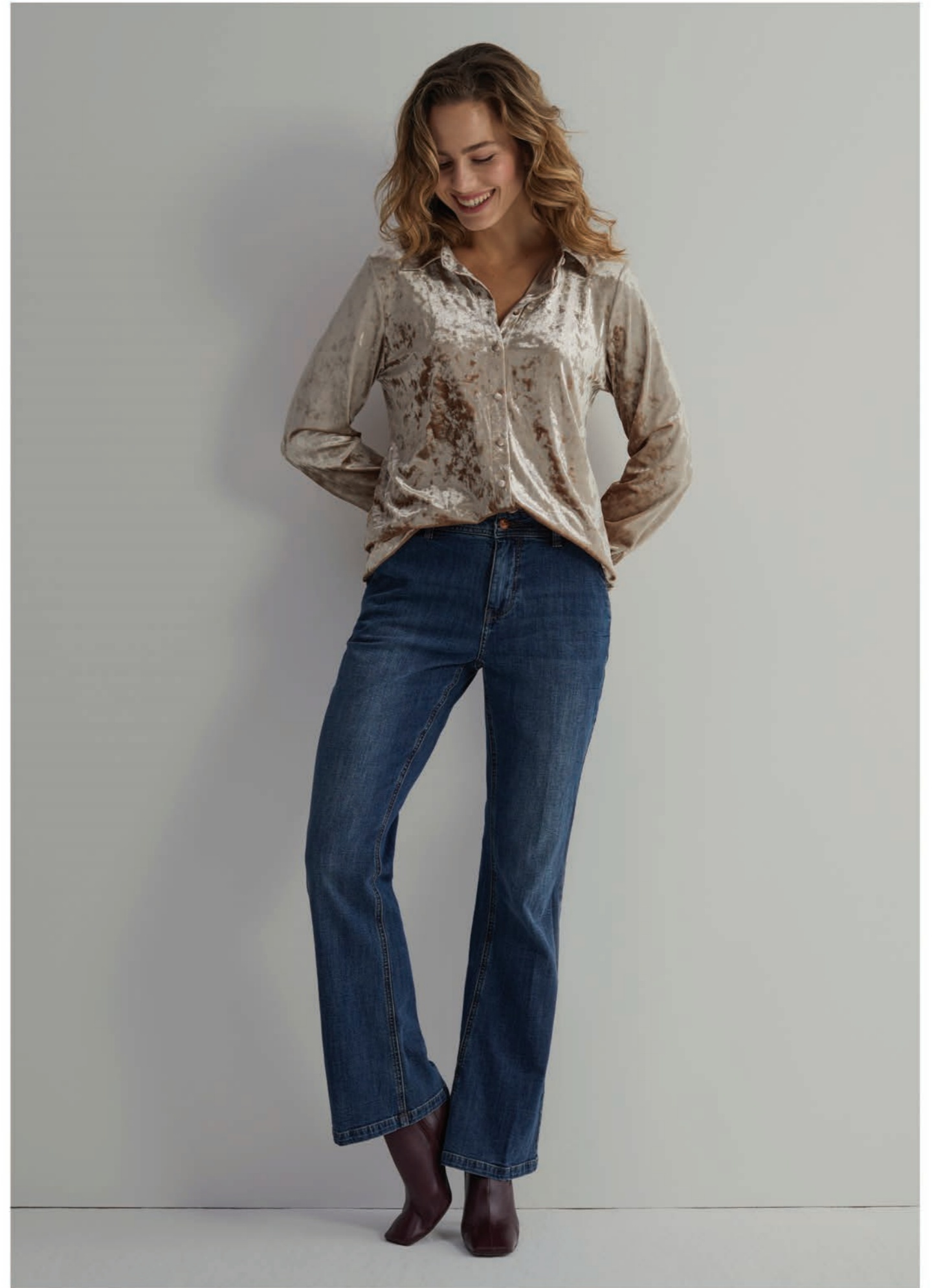
BOBIE CRUSHED VELVET | BIBETTE STONE USED