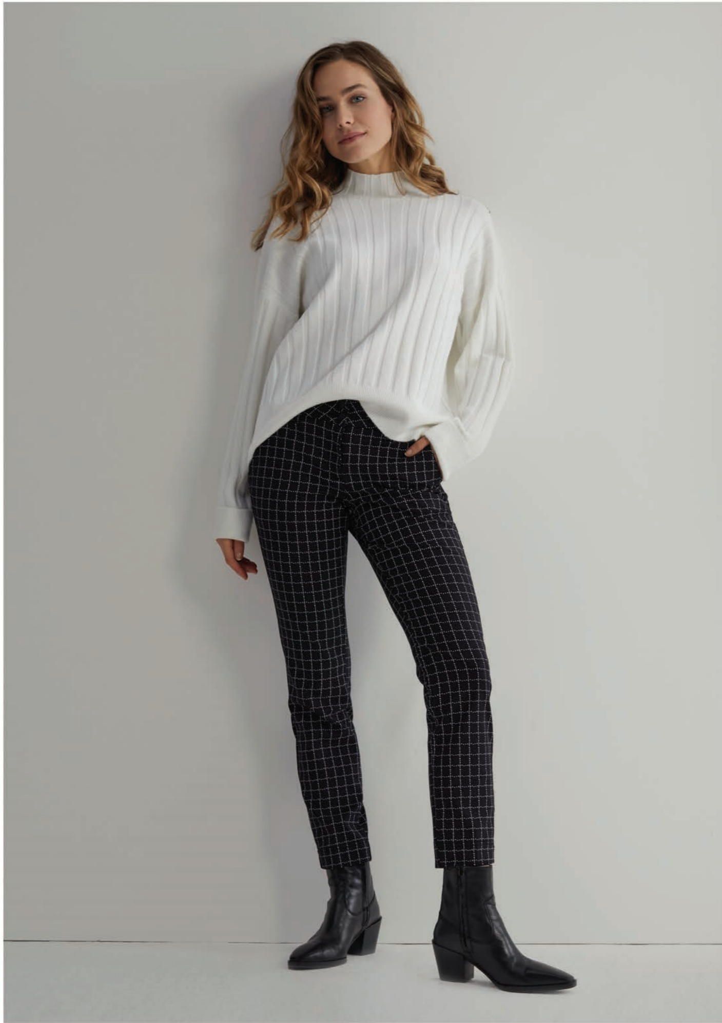
SWEET RIB AND TURTLE | DIANA FANCY CHECK