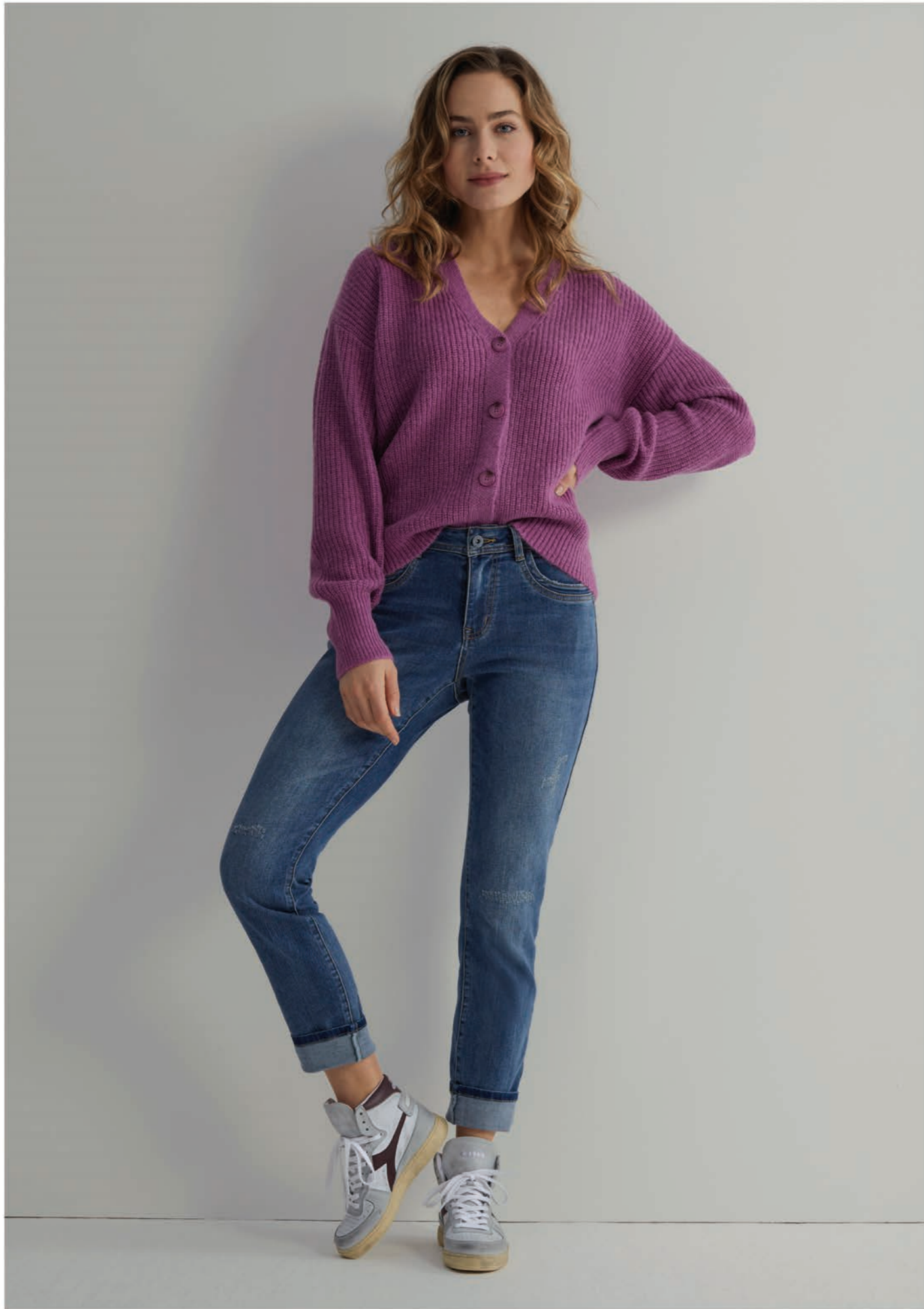
CARDIGAN V-NECK | LAILA RIP & REPAIR