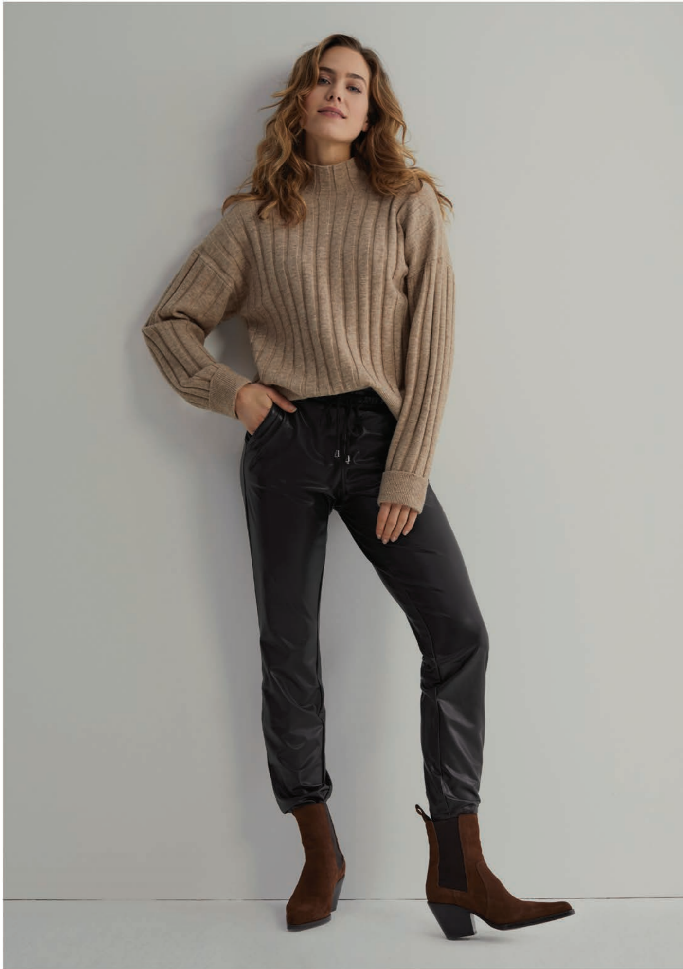
SWEET RIB AND TURTLE | TESSY FAUX LEATHER