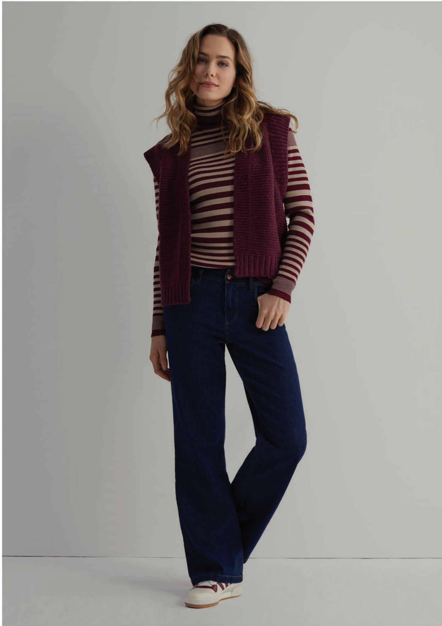
CARDIGAN SLEEVELESS | ROLL NECK FANCY STRIPE | COCO DARKBLUE