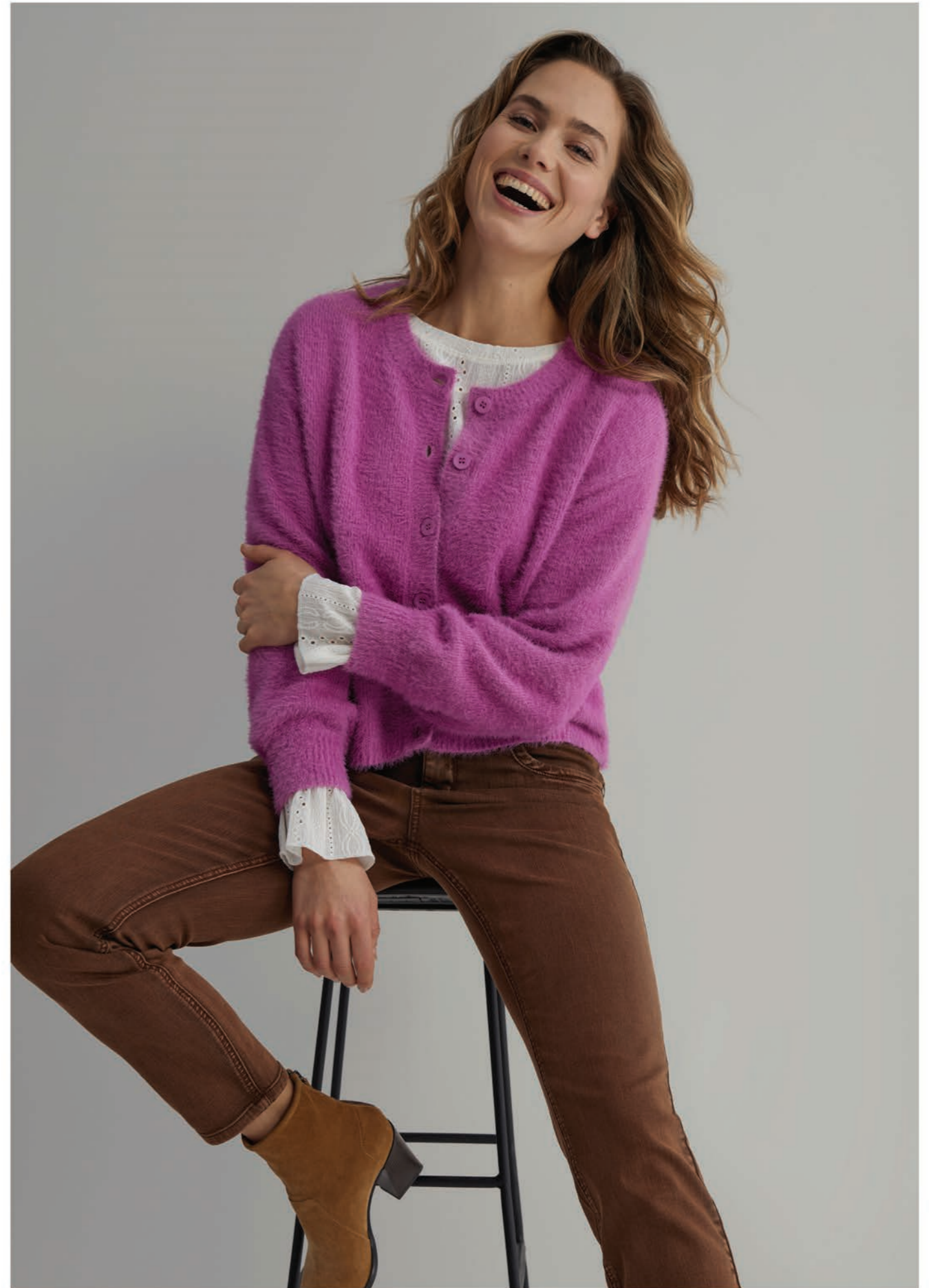
CARDIGAN FLUFFY | TEMMY AJOUR | SISSY COLOR