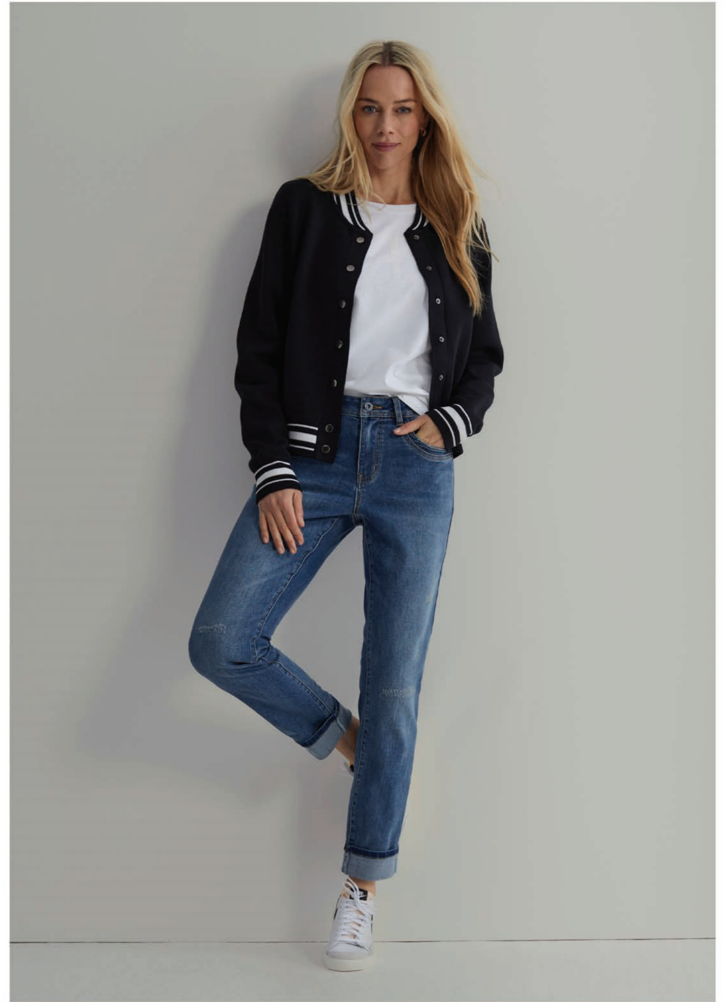
BIBA BOMBER JKT | TEMMY RB FLOCK | LAILA RIP & REPAIR