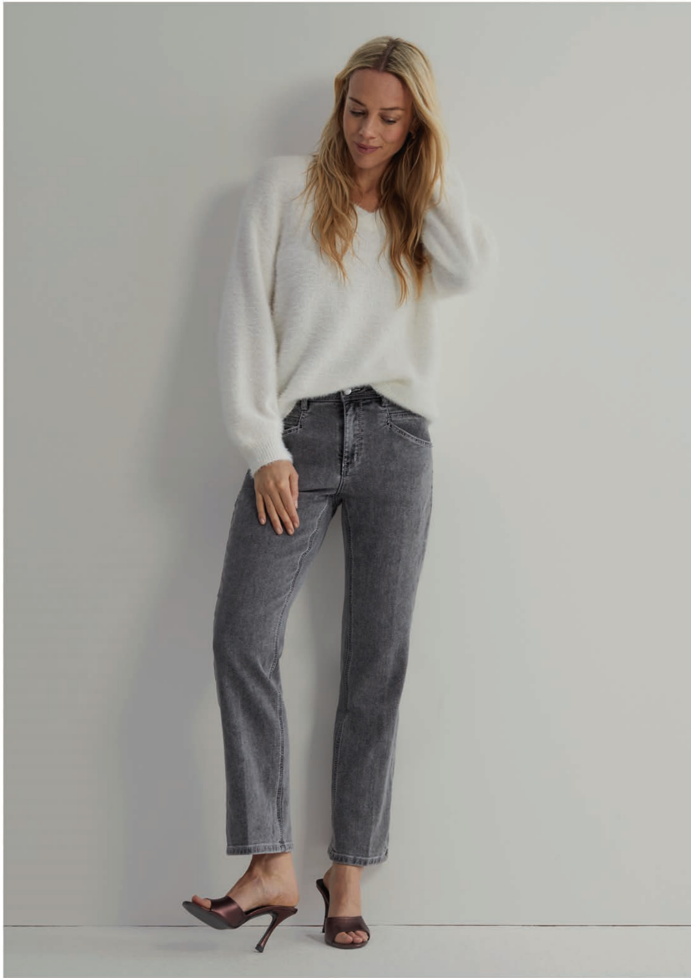
FAY FLUFFY | BABETTE CRP GREY DENIM