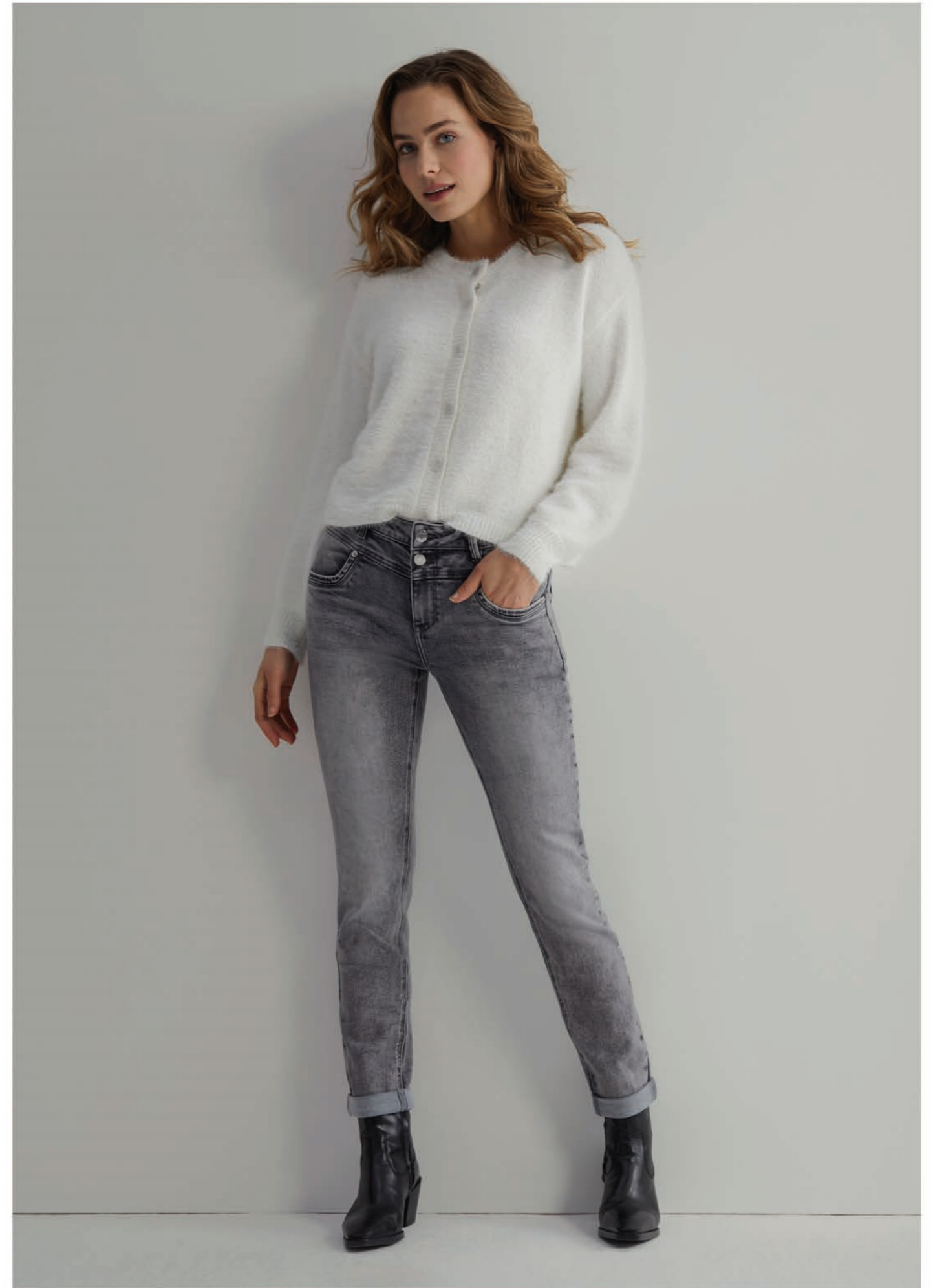
CARDIGAN FLUFFY | SIENNA GREY DENIM