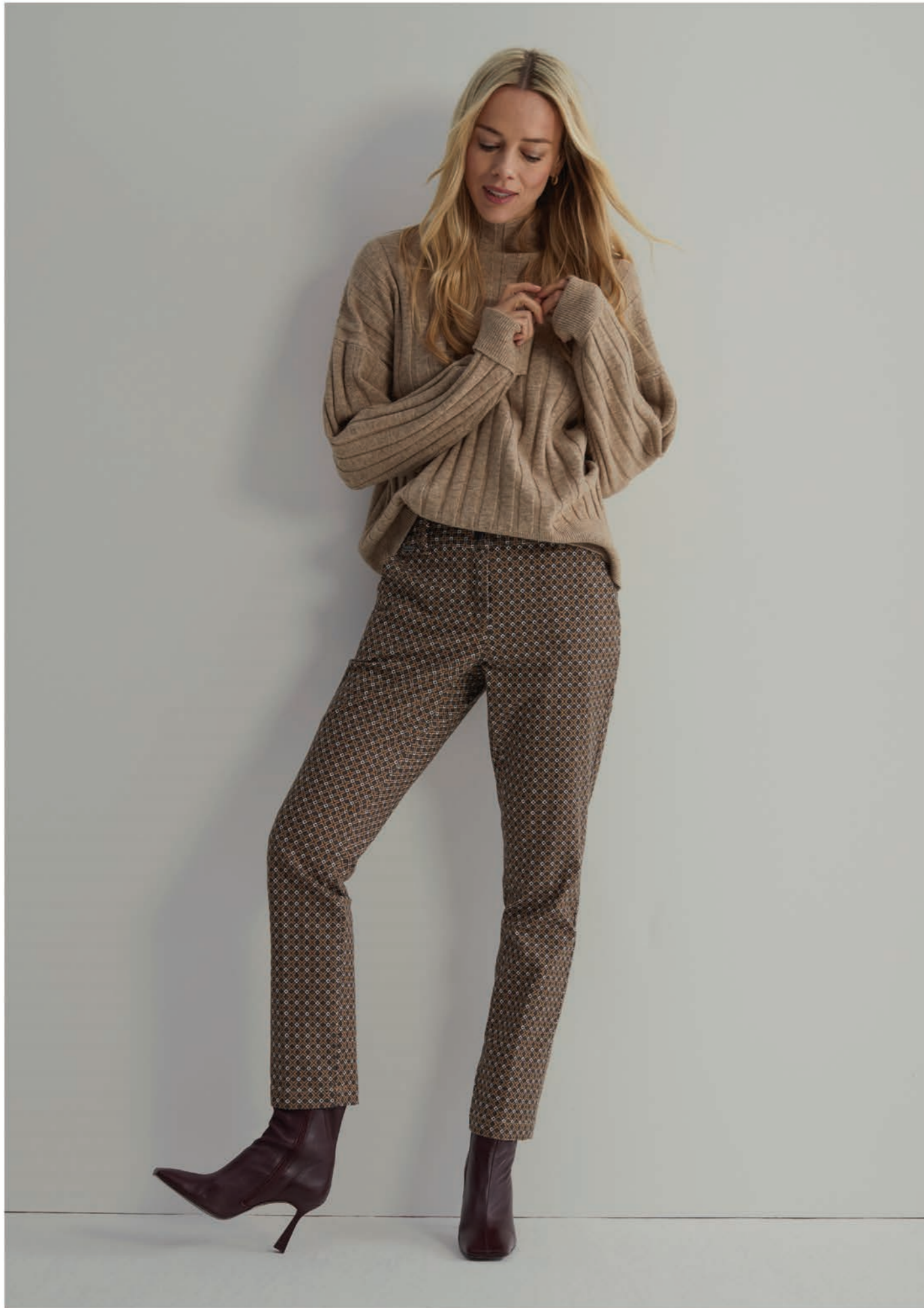
SWEET RIB AND TURTLE | DIANA FANCY PRINT