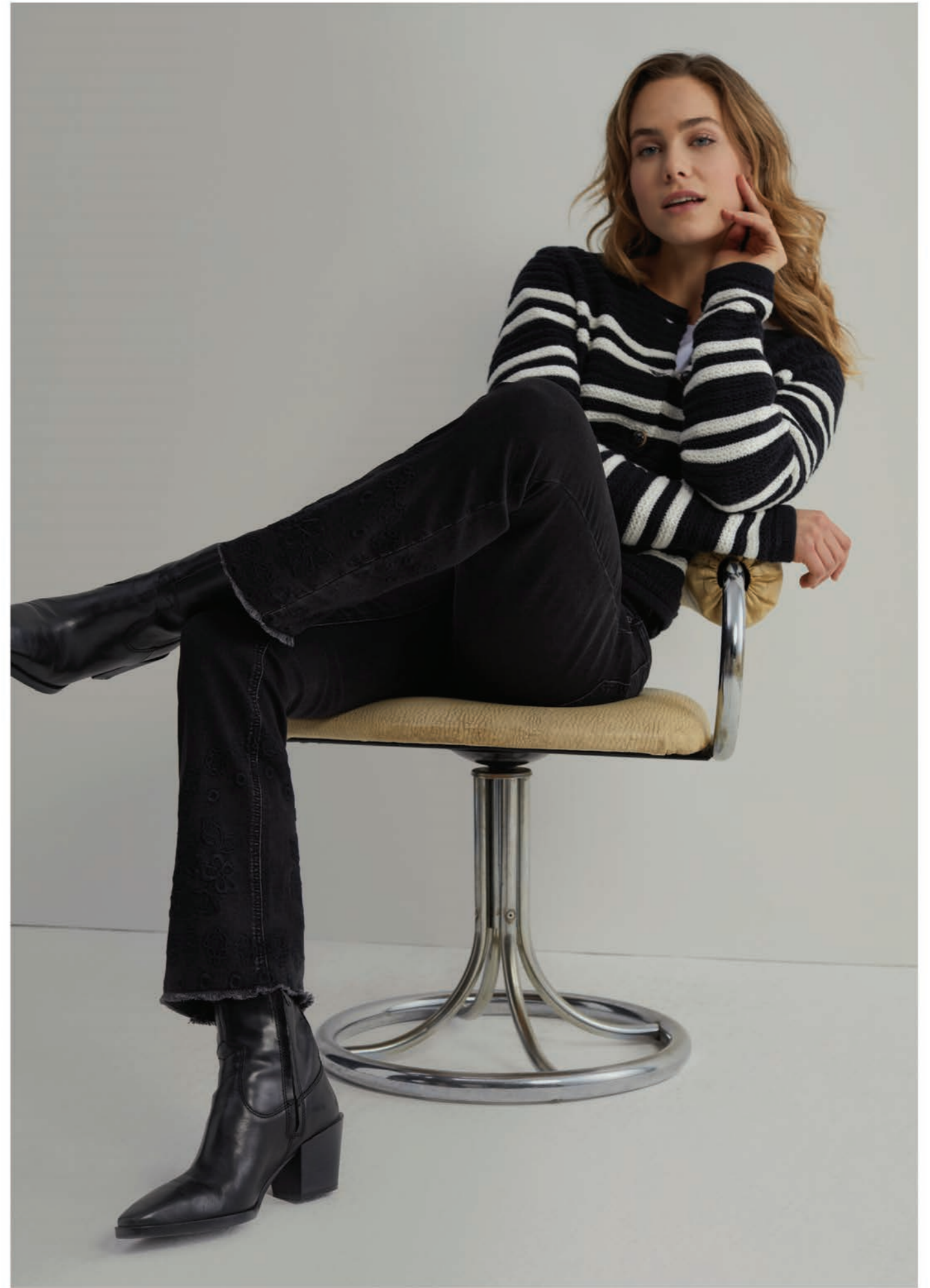
CHANEL STRIPE | BABETTE CRP JOG BLACK DENIM & EMBROIDERY