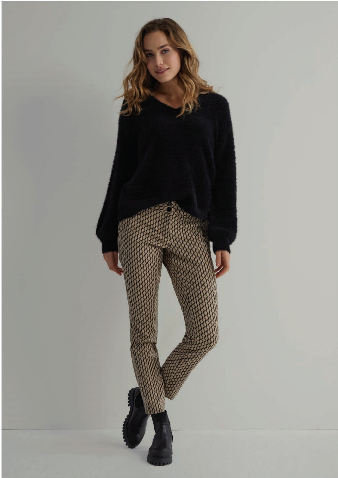
FAY FLUFFY | DIANA MULTI PRINT