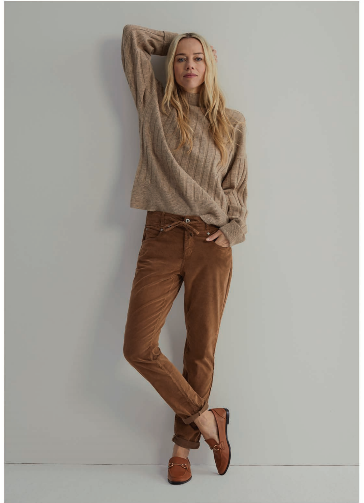
SWEET RIB AND TURTLE | RELAX FINE CORD