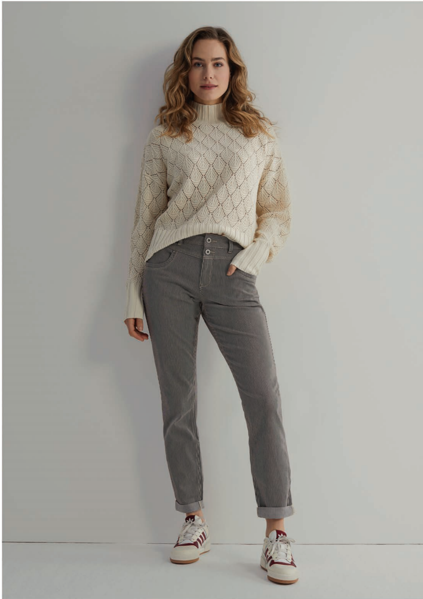
SWEET AJOUR AND TURTLE | SIENNA DENIM STRIPE