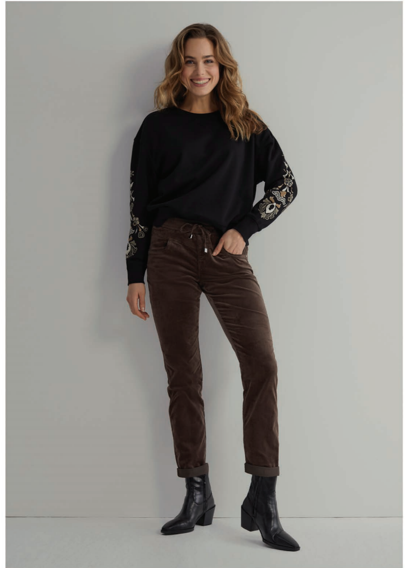
TERRY SWEATER MULTIPRINT | TESSY VELVET