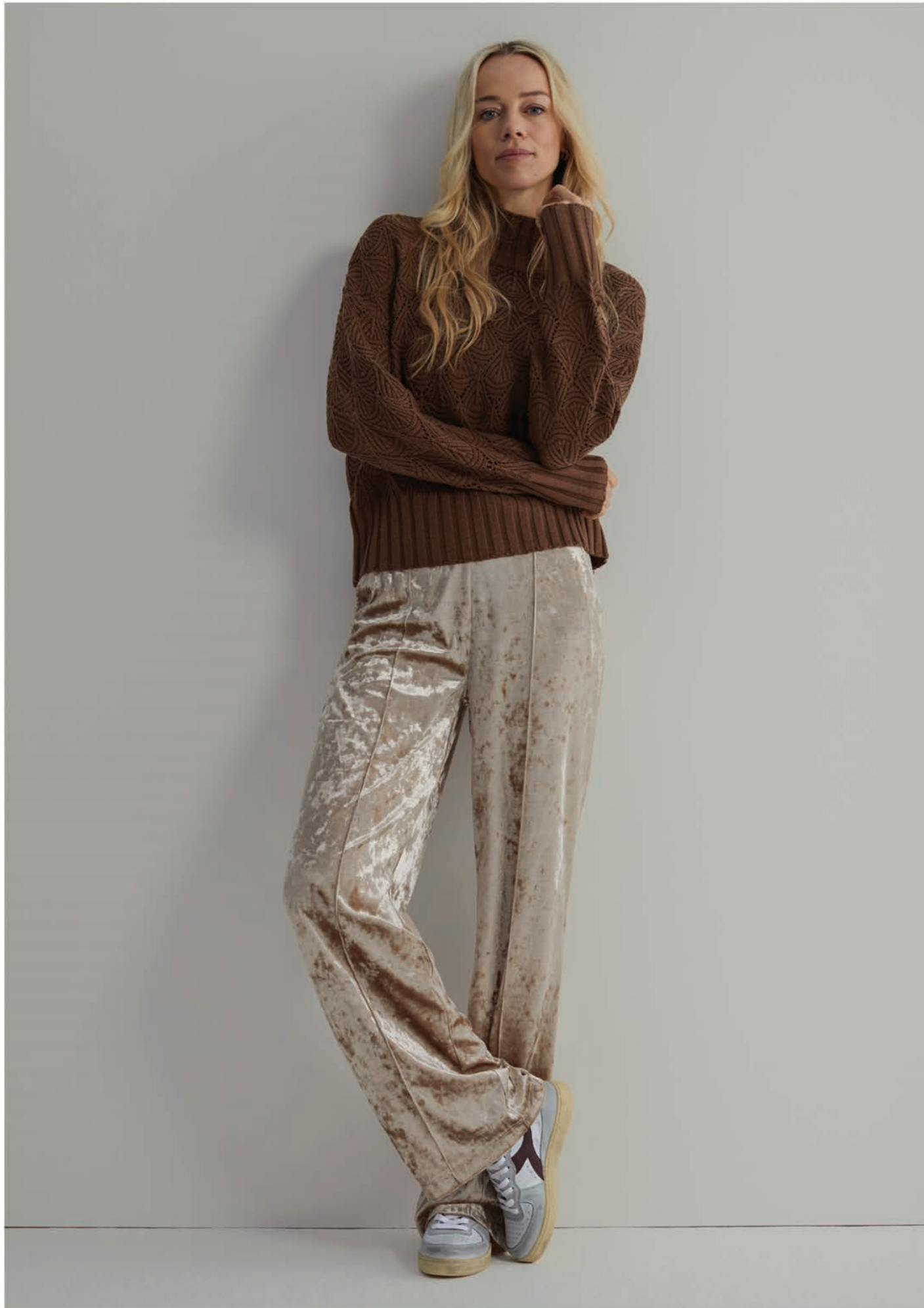
SWEET AJOUR AND TURTLE | COCO CRUSHED VELVET