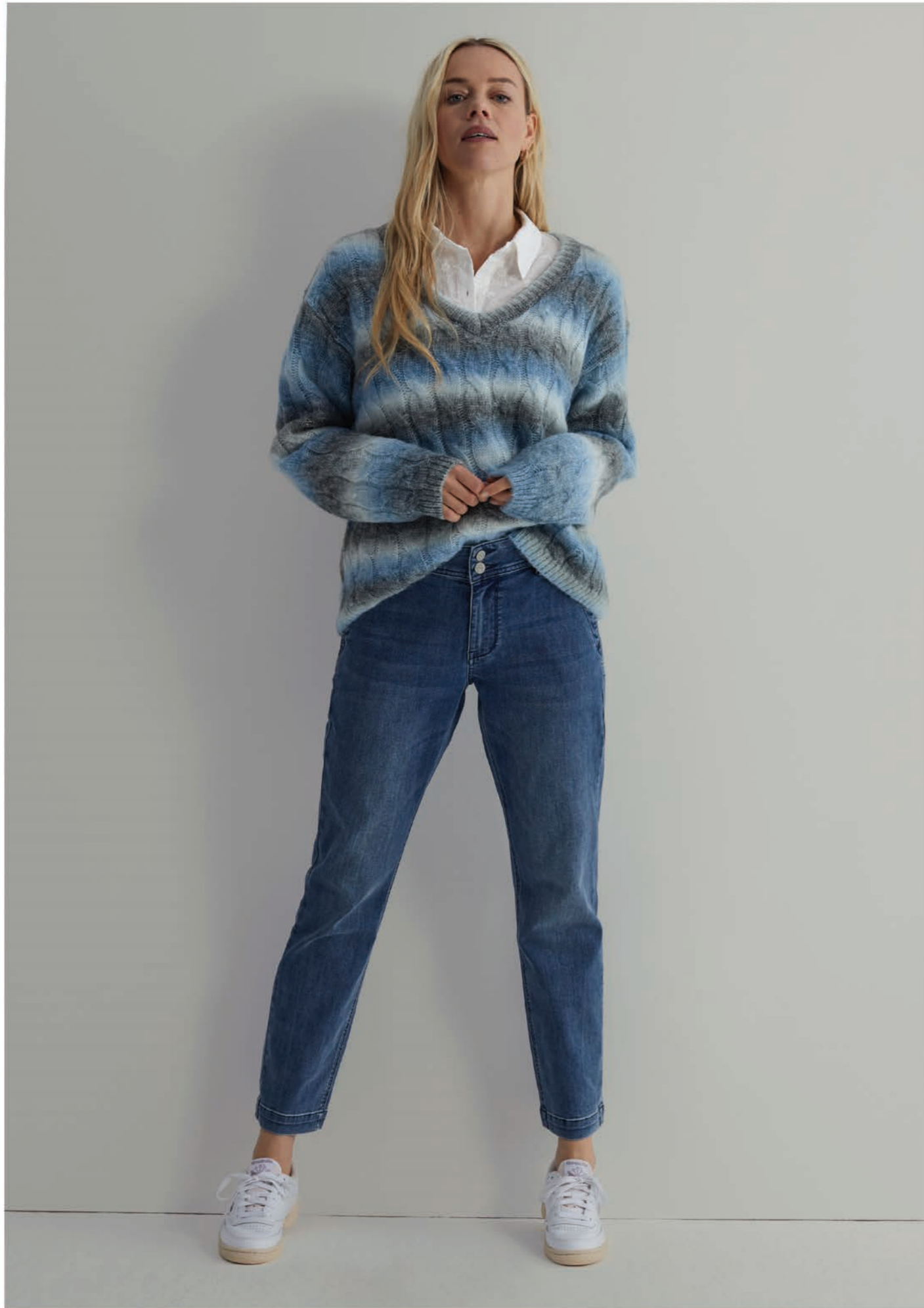
FAY CABLE & DEGRADÉ STRIPE | BOBIE EMBROIDERY | DIANA STONE USED