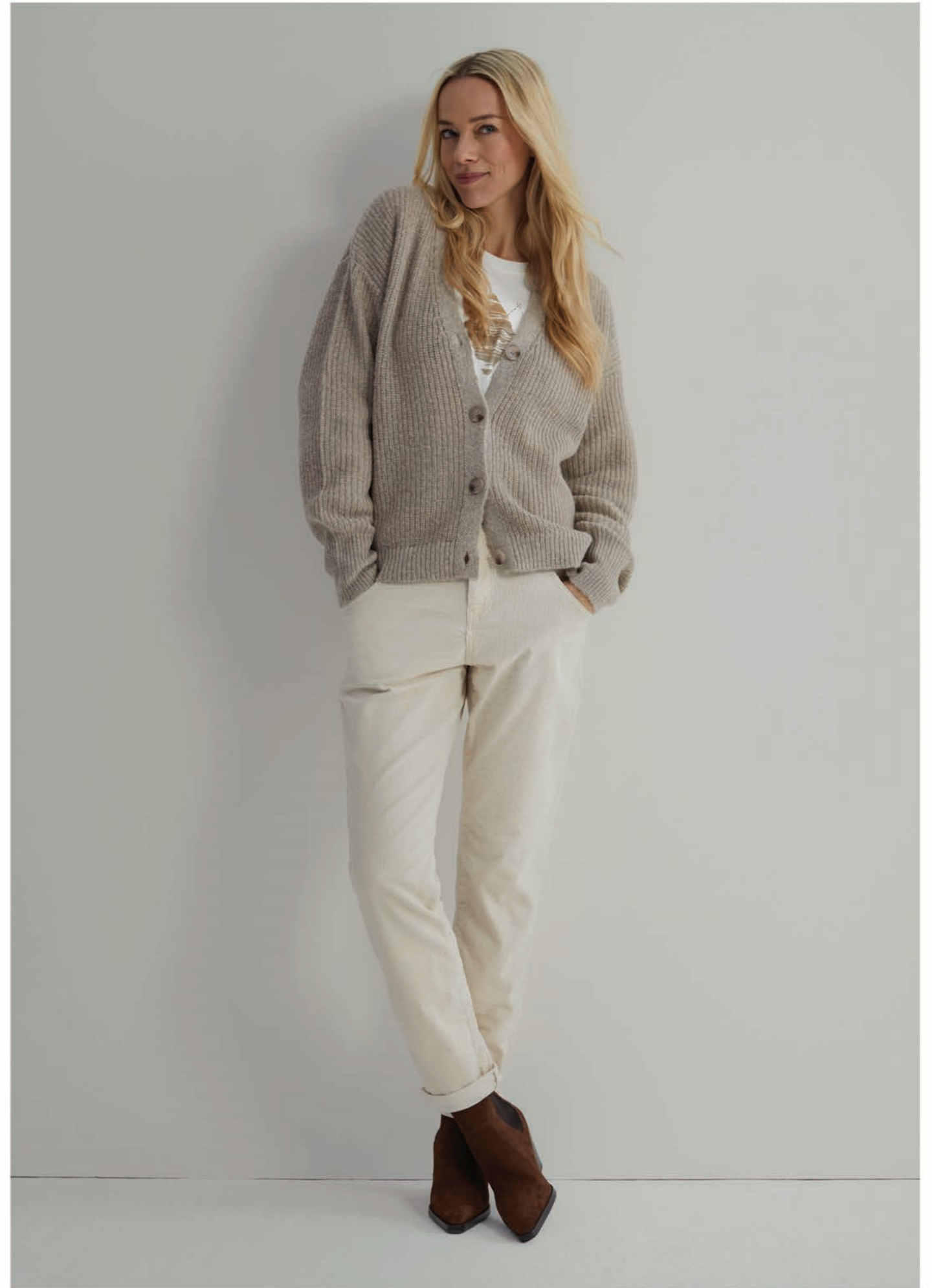
CARDIGAN V-NECK | TEMMY ARGYLE | SIENNA CORD