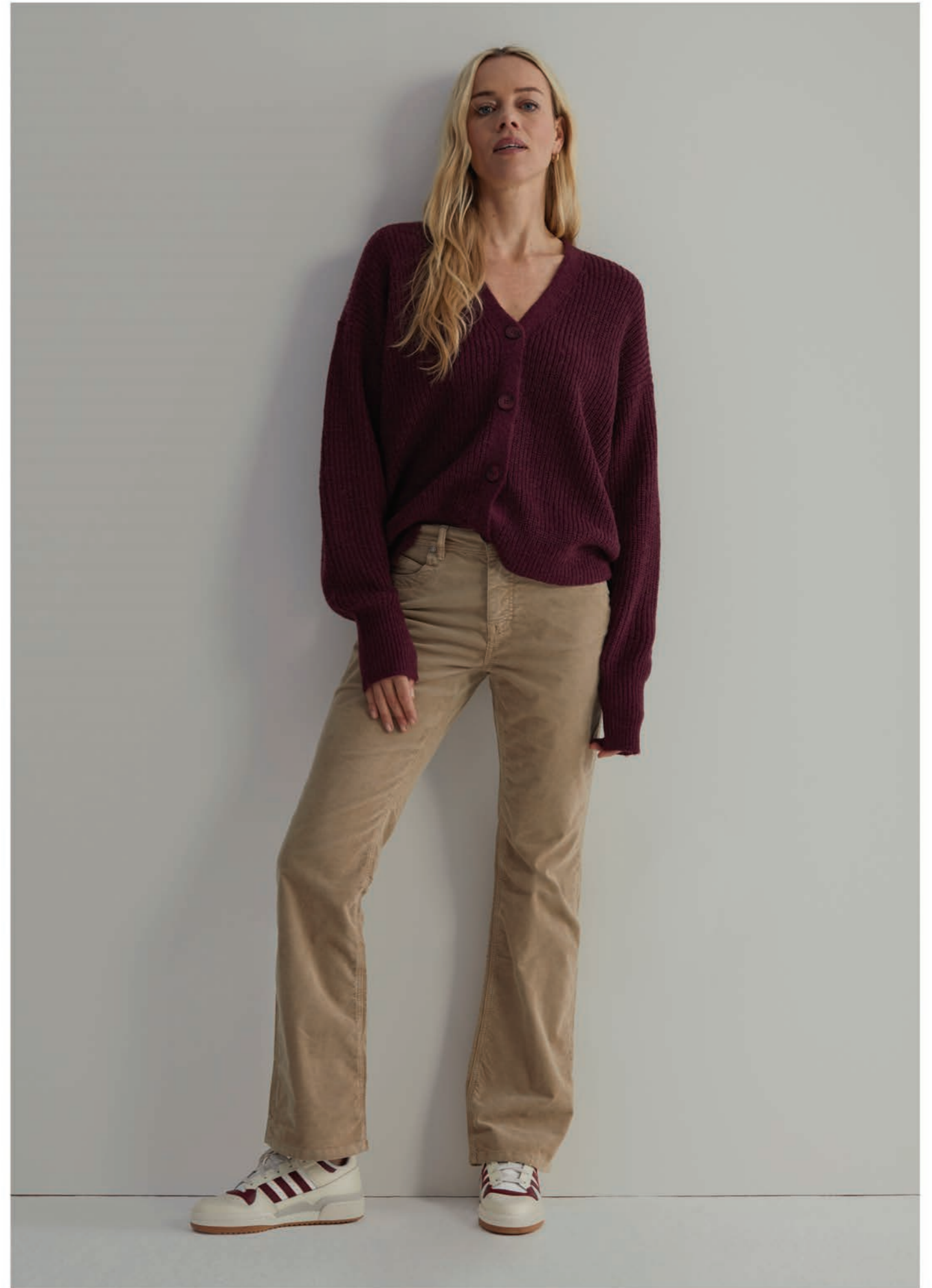
CARDIGAN V-NECK | BABETTE FINE CORD