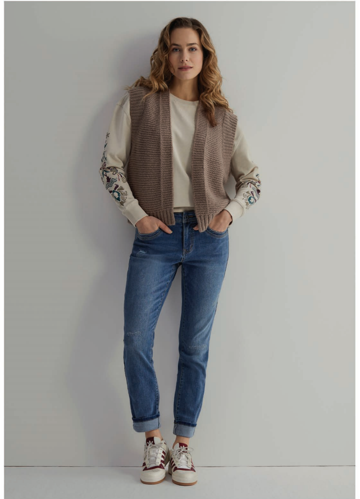
CARDIGAN SLEEVELESS | TERRY SWEATER MULTIPRINT | LAILA RIP & REPAIR