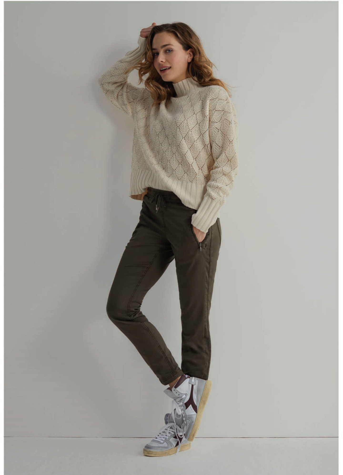
SWEET AJOUR AND TURTLE | BIBI JOGGER JOG