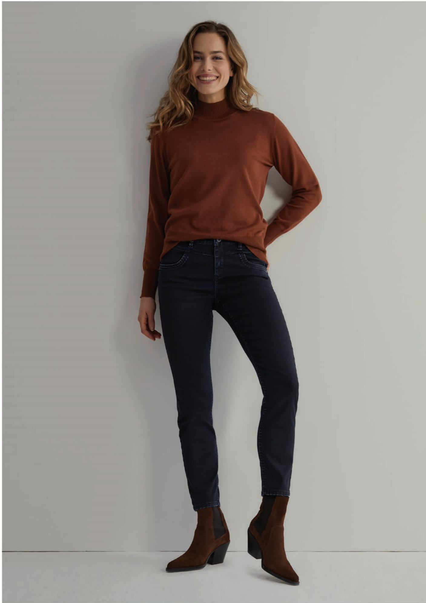
TURTLE NECK | MOLLY DARKBLUE COATING