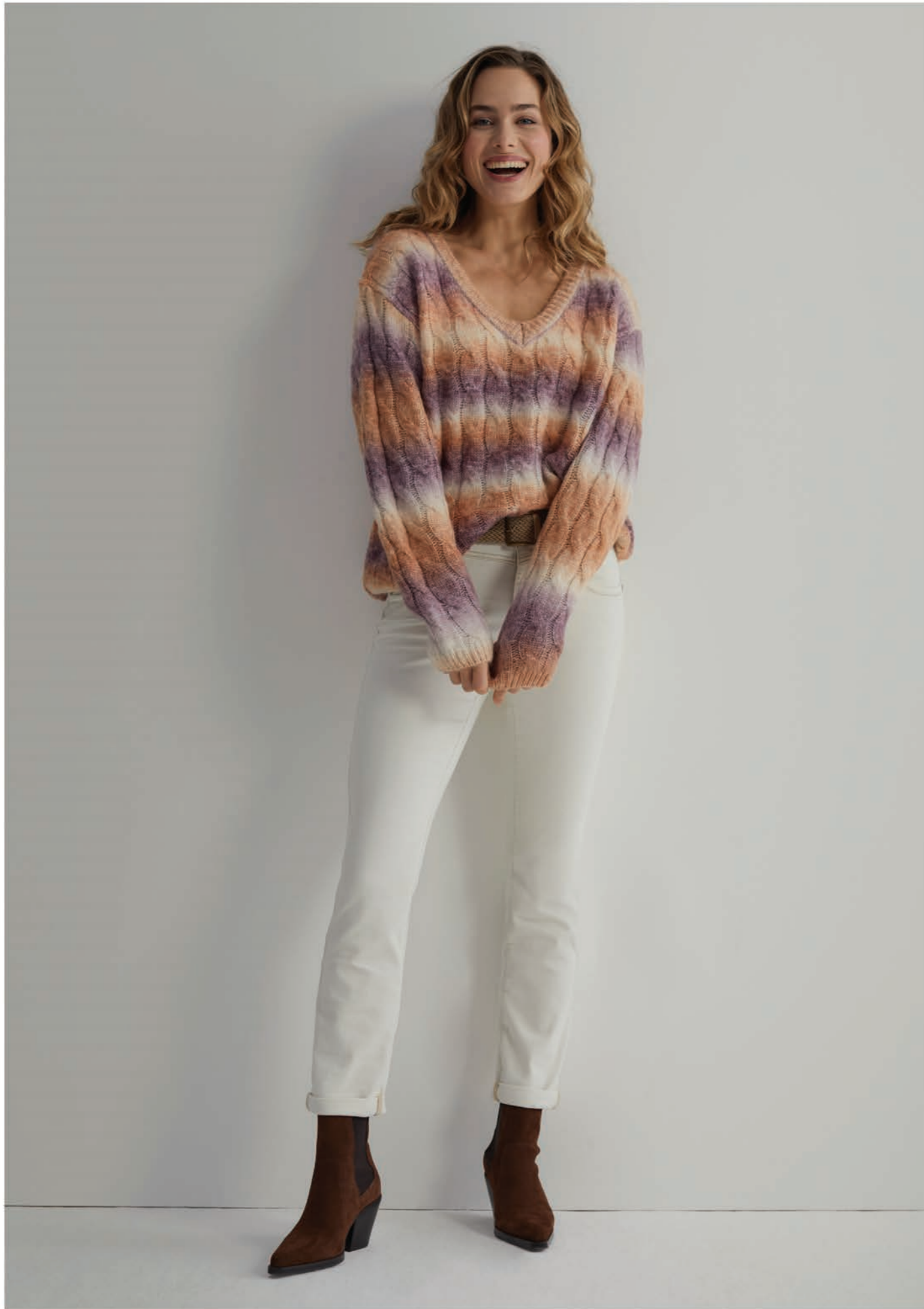
FAY CABLE & DEGRADÉ STRIPE | RELAX ECRU DENIM