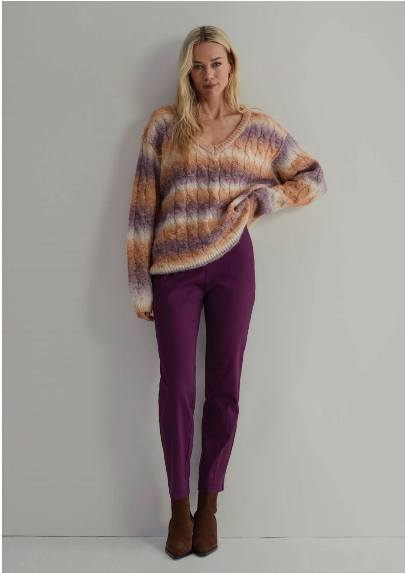
FAY CABLE & DEGRADÉ STRIPE | DIANA SMART