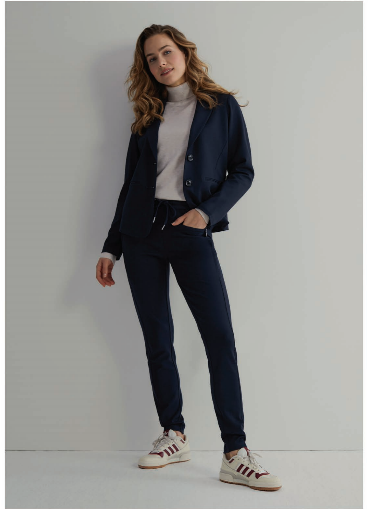
BLAZER PUNTA | SWEET ROLL NECK PUFF SLEEVE | TESSY PUNTA