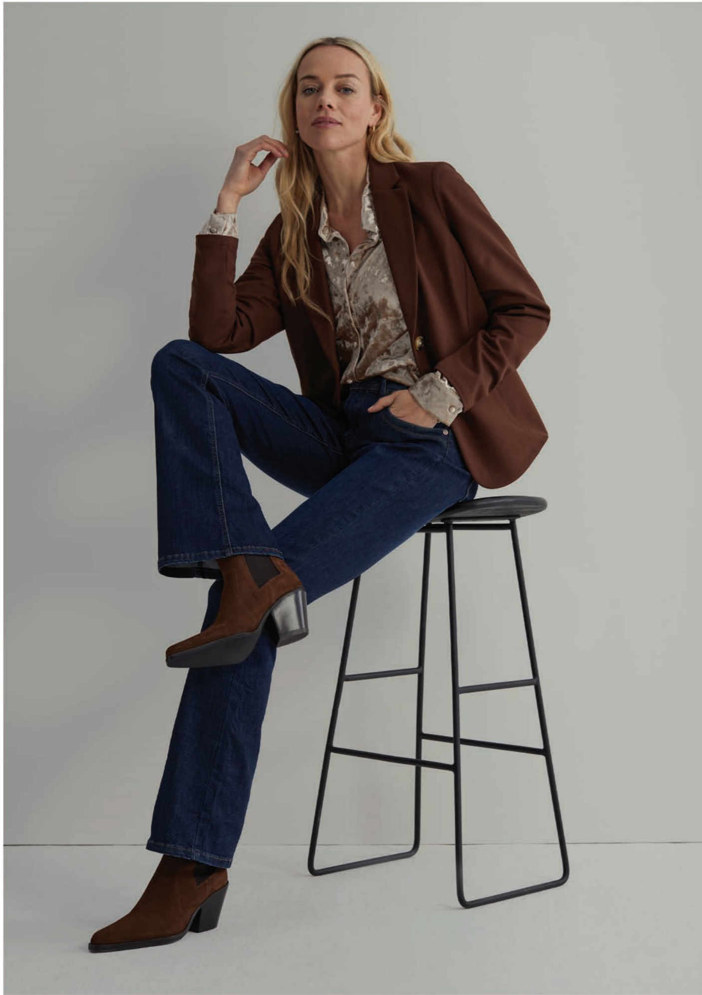
BLAZER PUNTA | BOBIE CRUSHED VELVET | BABETTE DARK BLUE