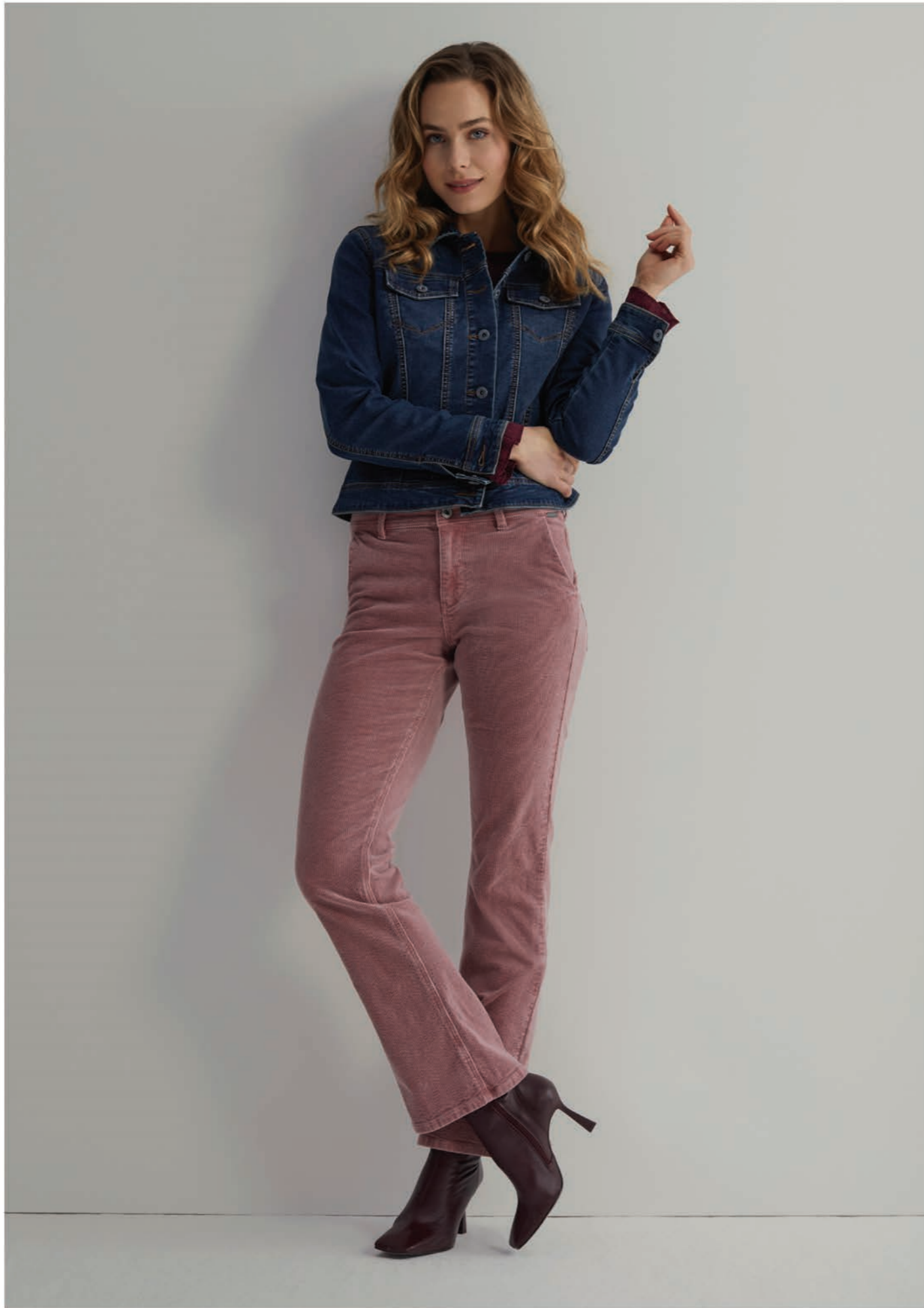
JACKIE JOG DENIM | TEMMY AJOUR | BIBETTE CORD