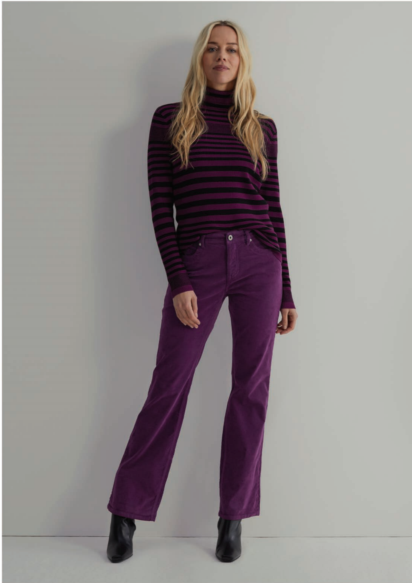
ROLL NECK FANCY STRIPE | BABETTE FINE CORD