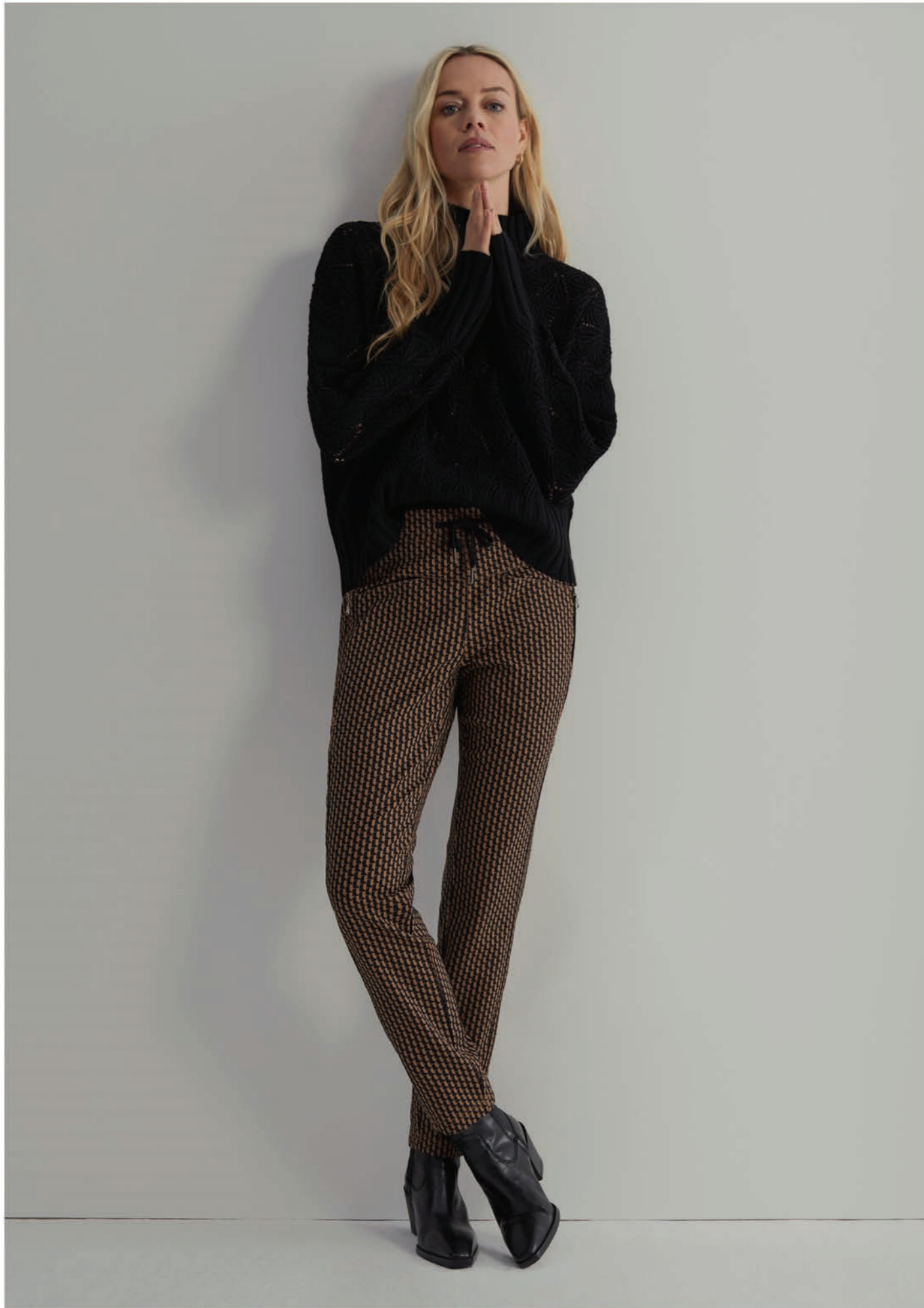
SWEET AJOUR AND TURTLE | TESSY 2-TONE PRINT